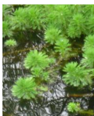
Fig. 1 M. aquaticum