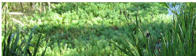
Fig. 2 Invasion of M. aquaticum in the tributary of Lake Porta