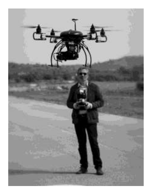
Figure 2. Dronetools quadcopter drone.

2 - 4 de junio de 2016 Escuela Superior de Arquitectura Universidad de Alcalá C/ Santa Úrsula, 8 28801 Alcalá de Henares (Madrid)