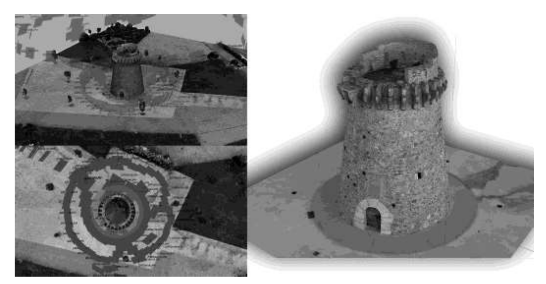
Figure 3. Photomodeling process by SfM and digital 3D modelling

The images used are conventional, made in principle with any camera, from any point of view, but keeping with the maxim that all parts of the model are visible at least from three different points of view. The process is based on automatic identification of homologous points in different shots, requiring previous calibration and orientation, which is also done automatically.