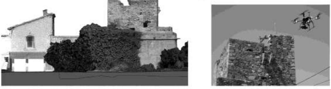
Figure 4. Photographic sequence, 3D digital model, dihedral view. Drone with four rotors.

For this project we used two drones manufactured by Dronetools, a quadcopter (quad) and an octocopter (octo). There are two fundamental differences between them: the quad is handled by a single operator who acts both as pilot and camera operator; while the octo requires a pilot and a camera operator, who will make use of his own command to operate the camera. Obviously, the quad has a lower elevation capacity, so it carries a lighter camera.