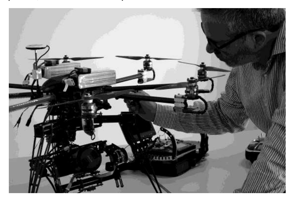
Figure 5. Eight-rotor drone. Completing the list of verification prior to transport to the place of flying.

On July 4, 2014 Royal Decree-Law 8/2014 on the operation of remotely piloted aircrafts, called drones, of less than 150 kg at take-off was approved. It established the exploitation conditions of these aircrafts to carry out technical and scientific works. That legislation has been published in the Official Gazette as Law 18/2014 dated on October 15th 2014. The regulation is defined as temporary and also includes compliance with the general scheme of Law 48/1960 of July 21st on Air Navigation. A summary of the most interesting aspects of this legislation is presented here, which is not intended to collect the totality of the law and procedures, to which one should refer in any case.