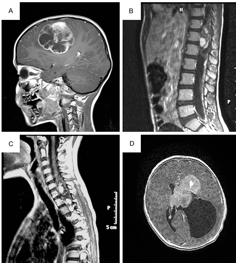
Figure 1. Preoperative Gd-enhanced T1-weighted MR scans showing GTNI lesions. A: Sagittal emispheric scan of case 1; B: Sagittal cervical spinal scan of patient 2; C: Sagittal dorso-lumbar scan of patient 3; D: Axial emispheric scan of patient 4.

GTR: gross total removal; PTR: partial total removal; HDCT: high dose chemotherapy; ACST: autologous stem cell transplantation; RT: radiotherapy; CR: Complete response; PR: Partial response.