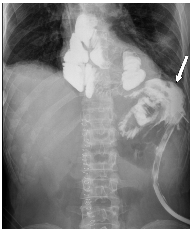
Figure 1. Contrast media leakage in left subdiaphragmatic region (arrow).

mentation at 50%, heart rate 80 bpm, mean arterial pressure 85 mmHg, peripheral oxygen saturation 100%, respiratory rate 18 acts per min). No complications occurred during the endoscopy execution, and procedure resulted negative for perforation.