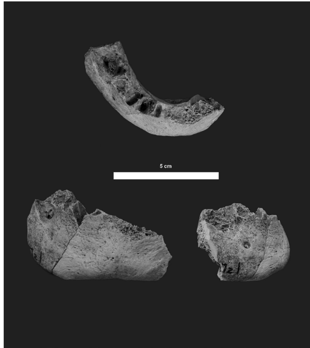
Figure 2. Riparo Mezzena mandible. IGVR 203334 specimen, top centre: superior view; bottom left: frontal view; bottom right: lateral view. The photos of the mandible were authorized by the Ministry for Cultural Heritage and Activities-Soprintendenza for Archaeological Heritage of Veneto, and taken by J.-J. Hublin; reproduction forbidden.

territory, which also include Riparo Tagliente, Grotta della Ghiacciaia and Grotta di Fumane 10–12 . The archaeological stratigraphic sequence of Riparo Mezzena is composed of three layers 9,13,14 . The lowermost and middle layers, layers III and II respectively, contain diagnostic Mousterian lithic industries. These levels are overlain by layer I, which was found to contain a mixture of Palaeolithic and later pre- and proto-historic artefacts, including ceramics attributable to the Iron Age. During the study of the faunal assemblage by Angelo Pasa, nine bone fragments from layer I and four fragments from the other two layers were identified as human. These 13 remains include an incomplete mandible, 11 cranial fragments and one post-cranial bone fragment. A monograph by Corrain 15 tentatively attributed the fragmentary mandible IGVR 203334 to a female Neanderthal, presumably based on the presence of Mousterian lithic industries in all three layers rather than on the size and morphology of the specimen, which displays possibly modern features (Fig. 2) 15 .