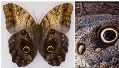
Ocelli: butterfly "Caligo Prometheus", from Caillois (1960).

It is actually a kind of vertigo that the motionless circle produces. A vertigo that Caillois had already analyzed in Les démons de midi ( The Noontide Demons ), 1936, and which is basically an identification with the inanimated world. "Ver-rà la morte e avrà i tuoi occhi" ("Death will come and will have your eyes"),