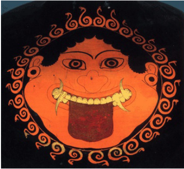
A Gorgoneion: Gorgon's head , ca. 460 B.C.

To get back to Caillois, it is maybe no accident, that only a few years before Les démons du midi an Italian scholar, Mario Praz, dedicated to the “Medusean beauty” the first chapter of his book, La carne, la morte e il diavolo nella letteratura romantica (Flesh, Death and the Devil in Romantic Literature), and that this chapter ends actually with Baudelaire.