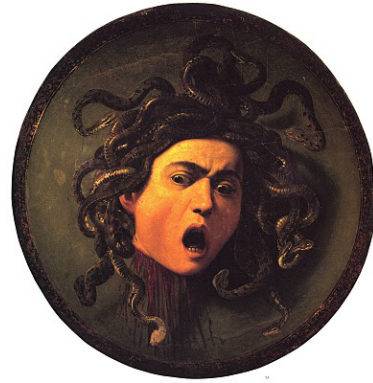
Caravaggio, Medusa , ca. 1597, Florence, Uffizi.

It was the most fascinating ring I have never seen. Cut in a dark, solid garnet, it portrayed Medusa's head. [...] Worn on the finger, the ring seemed merely the most perfect of signet rings. You entered its secret only taking it off and contemplating the head against the light. As the different strata of the garnet were unequally translucent [...] the somber bodies of the snakes seemed to rise above the two deep, glowing eyes, which looked out from a face that, in the purple-black portions of the cheeks, receded once more into the night (Benjamin 1932, 616).