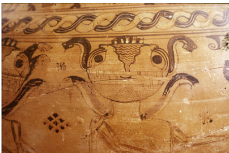
The Gorgons , Eleusis amphora (Proto-Attic), Eleusis Museum.