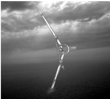
Walter Benjamin, Ex Libris for Valéry , reconstructed.

Spark and awakening. That brings to mind of course Benjamin’s thought in The Arcades Project about awakening, and about the dialectical image as “an image