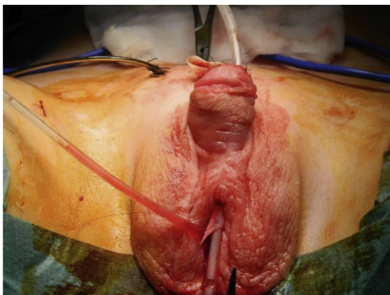
Figure 3 Bladder mucosa graft tunneled from proximal hypospadiac meatus and tip of the glans.

A compressive dressing was applied for 2 days. The urinary catheter was maintained to dwelling for 2 weeks. This was necessary to verify the proper capacity and to analyze micturition and verify correct healing. The suprapubic cystostomy was removed 2 weeks later, ambulatory by verifying micturition. Surgical complications and additional urethral surgeries following definitive hypospadias repair were defined as procedures that required surgical intervention under general anesthesia (Grade IIIb Clavien classification). We adopted the Hypospadias Objective Penile Evaluation (HOPE)-scoring system to assess the postoperative results during the follow-up period.