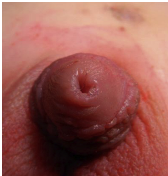
Figure 5 Final appearance of neo-urethral meatus.

early complication registered during hospitalization was a postoperative infection in one patient (2%, 1/50 patients) at the site of anastomosis between the bladder mucosal graft and native urethra, provoking a urethrocutaneous fistula.