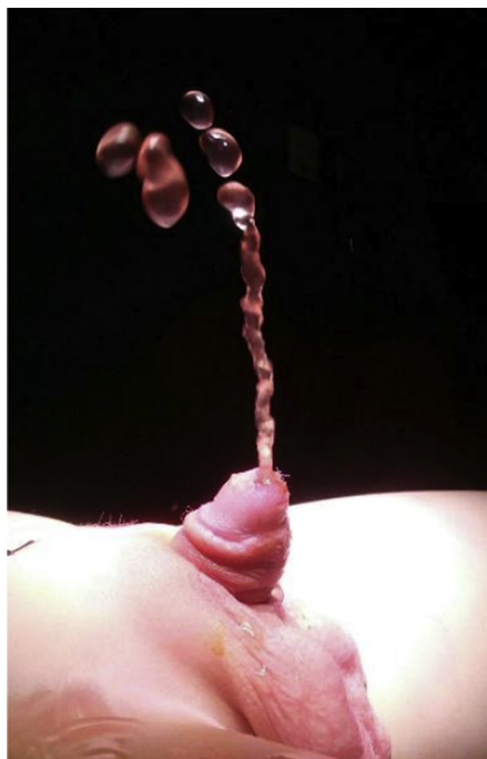
Figure Urethral micturition after bladder graft mucosa urethroplasty.

Our results show that bladder mucosal graft for primary severe proximal hypospadias in selected patients is a possible alternative to other commonly used techniques, with the aim of restoring recovery of the normal continuity of the distal urinary tract see figure below.