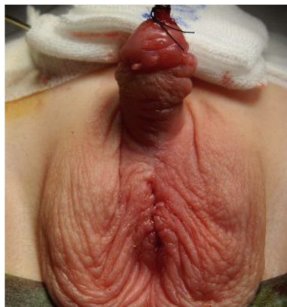
Figure 4 Final appearance.

The mean time of complication occurrence was 15 months (median 15.5 months, range 1–96 months). The