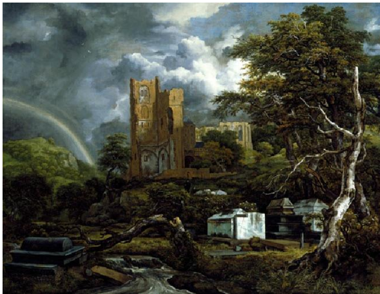
Figure 2. Jacob Isaaksz van Ruisdael, The Jewish Cemetery , 1654 or 1655, Oil on Canvas. Detroit Institute of Arts, 26.3.