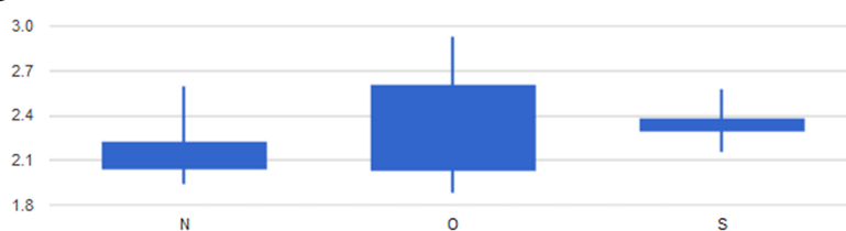
Figure 3. Example of statistics for zinc coordination spheres in the PDB. The information is accessible from the ‘Per metal’ statistics menu. (A) Pie chart displaying the coordination geometries of zinc sites; (B) histogram reporting the occurrence of residues in the first coordination sphere of zinc ions; (C) distances between zinc ions and different donor atoms.