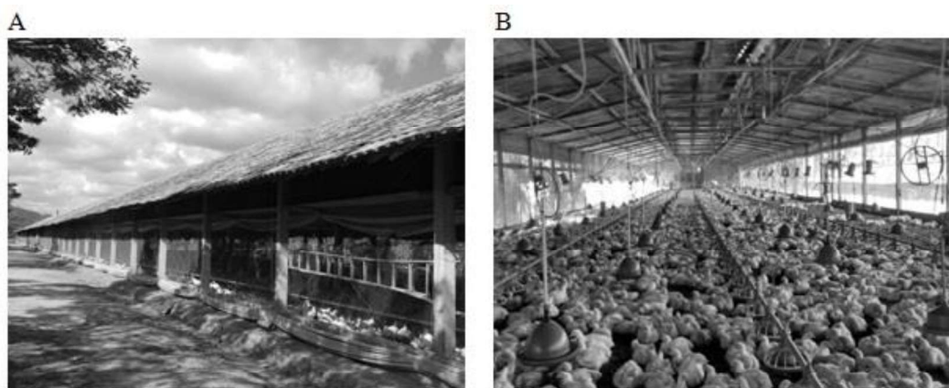
Figure 2. External (A) and internal (B) view of one of the evaluated facilities.

A layer of bedding was kept on the floor (approximately 10 cm depth) and the stocking density was maintained between 14 and 18 birds per m 2 . The animals were Cobb males. The birds were fed with the same feed, made using the ideal protein concept, which is widely used for the broiler production industry (Campos et al., 2012).