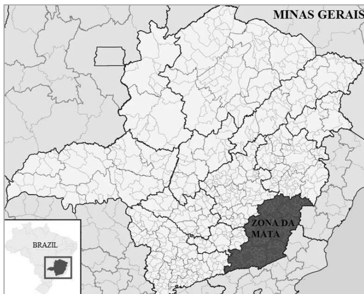
Figure 1. Location of the Zona da Mata, Minas Gerais, Brazil.

This study was conducted in farms for broilers production, located in the region of Zona da Mata of Minas Gerais, Brazil (Fig. 1). The poultry facilities were subjected to similar climatic conditions. The climate of this region according to the Köppen classification, is the type Cwb - tropical climate of altitude, with rainy summer and mild temperatures.