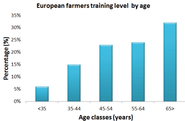
Fig. 1 - Results of European farmers training by age.