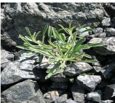
Fig. 1 Silene paradoxa on serpentine soil.