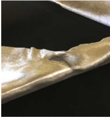
Figure. 2. High-end leather works in Tuscany manufacturing processes

In the last decade we highlighted a significant global business development characterized by emerging large fashion corporations. These financial groups (as LVMH or Kering) need to increase the production, often supporting and reinforcing a renewal strategy of the advanced craftsmanship companies (Goretti, 2017).