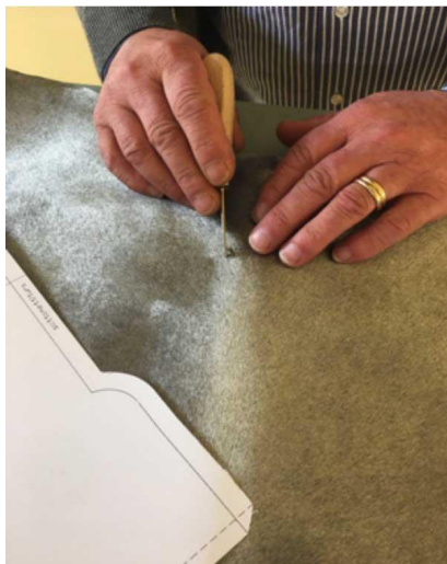
Figure. 3. Leather cutting by hand following the pattern guidelines

Anyway, the production structure did not change. Tuscan artisanal SMEs improved the production by increasing the number of workers and acquiring new machines, not following the rules of the serial production as a way to augment the production outputs. In this phase, the manufacturers also changed the structure of production companies: the emerging influence of the big financial groups and the matter of production development created a kind of 'subjection' by those companies to the big global "griffes". The manufactures become contractors or suppliers contractors, in a solution of high dependence from the brands. Meantime, we highlight that for them is increasingly more difficult than in the past to present their own trademark with a proper positioning in the global market.