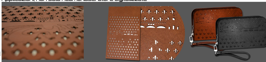
Figure. 4. Ricamo 4.0 – visualization framework

Applicazioni, non solo ricamo: laserature digitalizzate