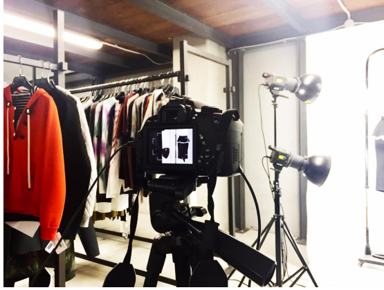
Figure. 5. Unomaglia Photoshooting and archive setting