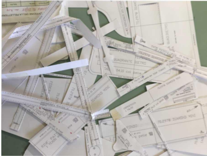
Figure. 1. Leather patterns

The “historical” excellence in manufacturing is connected to sociological values and policies that since the Middle Ages were present in the city centre of Florence. The Guilds know-how was diffused along the Arno River valley creating a production system organized in districts, full-cycle production areas dedicated to specific manufacturing supply chains. Today, in example, in the Santa Croce quarter, whose name didn’t change since the Middle Age, we find “via delle conce” (leather tanning street) or furriers street, shoemakers and leatherworkers street and many others.