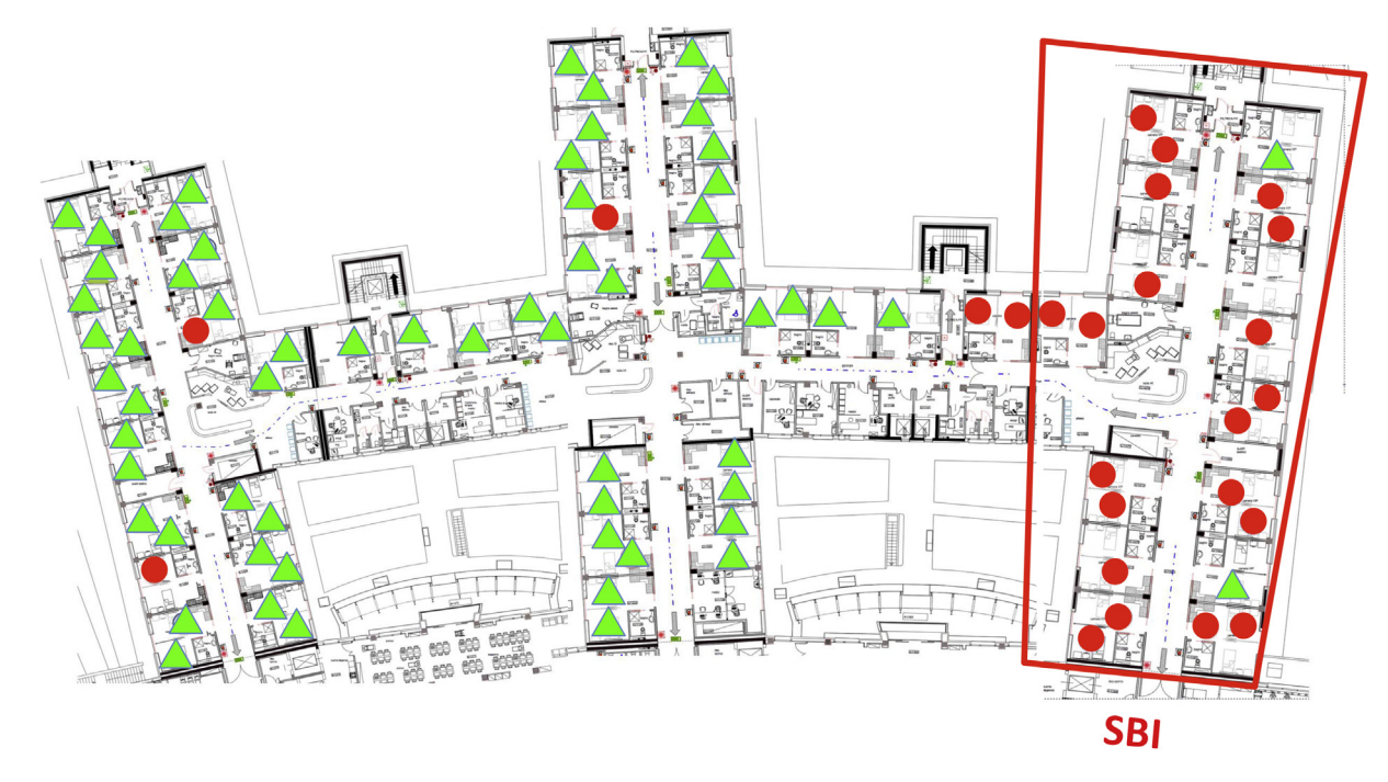
Figure 1. Results of the point prevalence survey for rectal colonization of carbapenemase-producing Enterobacteriaceae performed in January 2016: spatial distribution of colonized (red dot) and non-colonized (green triangle) patients. SBI, severe brain injuries ward.

population of patients admitted to a large LTACRF was not homogeneous in terms of risk for CRE colonization and infection, and found that patients admitted to the SBI ward were at much higher risk, with KPC-KP carriage rates that could reach 90%. This condition was apparently related to both a higher carriage rate at admission and a higher risk for crosscontamination after admission. Considering that patients from SBI wards are characterized by longer LOS and are typically exposed to a higher intensity of care, often including mechanical ventilation, these findings are in overall agreement with previous findings that identified mechanical ventilation and length of stay as two independent risk factors associated with CRE colonization in LTACRFs [12], and a number of features of the population of patients colonized/infected by CRE such as older age, high rates of comorbidities (including renal disease, advanced stage wounds and respiratory failure), and need for indwelling devices (including central venous catheters and tracheostomies) [17].