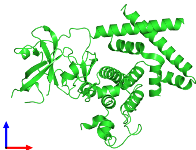
Fig. 2. The crystal structure of pseudokinase PEAK1 (Ha and Boggon, 2017), obtained through a combination of CCP4 online pipelines and the ARP/wARP web-service.

The information technology infrastructure that supports these researchers must keep pace with new demands. It must provide implementations of algorithms that can integrate data from different methods, and help track the processing steps and data in these increasingly complex projects (Morris, 2013). This e-infrastructure should ideally be provided as web services with user-friendly interfaces. While, for example, an experienced crystallographer may easily install and use the CCP4 suite (Winn et al., 2011), a researcher undertaking crystallography for the first time may find installation of the full suite a