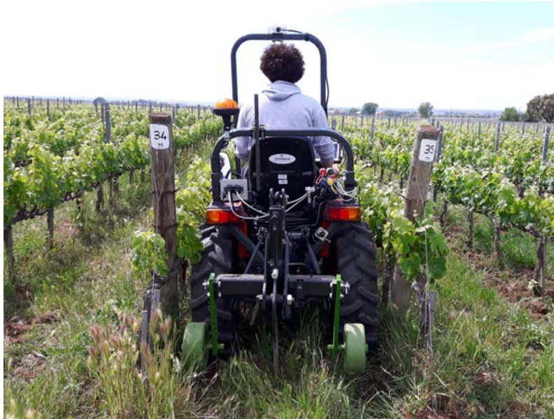
Figure 3 On the go measurements in high-density vineyard.