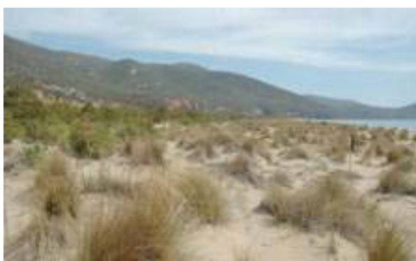
Fig. 1. Coastal dune vegetation (Parco dell’Uccellina)

We detected significative differences in abundance and species composition between EUNIS habitat types, between SACs, and between habitat types within SACs. In particular, our data shows particular differences between communities of north and south of Tuscany: the northern SACs to Serchio river are heavily impacted by the presence of mass tourism, with bathing establishments, roads and human trampling. From these evidences can be deduced that trails installed within the DUNETOSCA Life Projects and aimed to reduction of tourism impact may be insufficient to reduce anthropic pressures in those contexts and adequate conservation strategies are required.