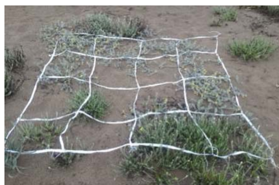
Fig. 2. Plot of 2 x 2 m for floristic surveys