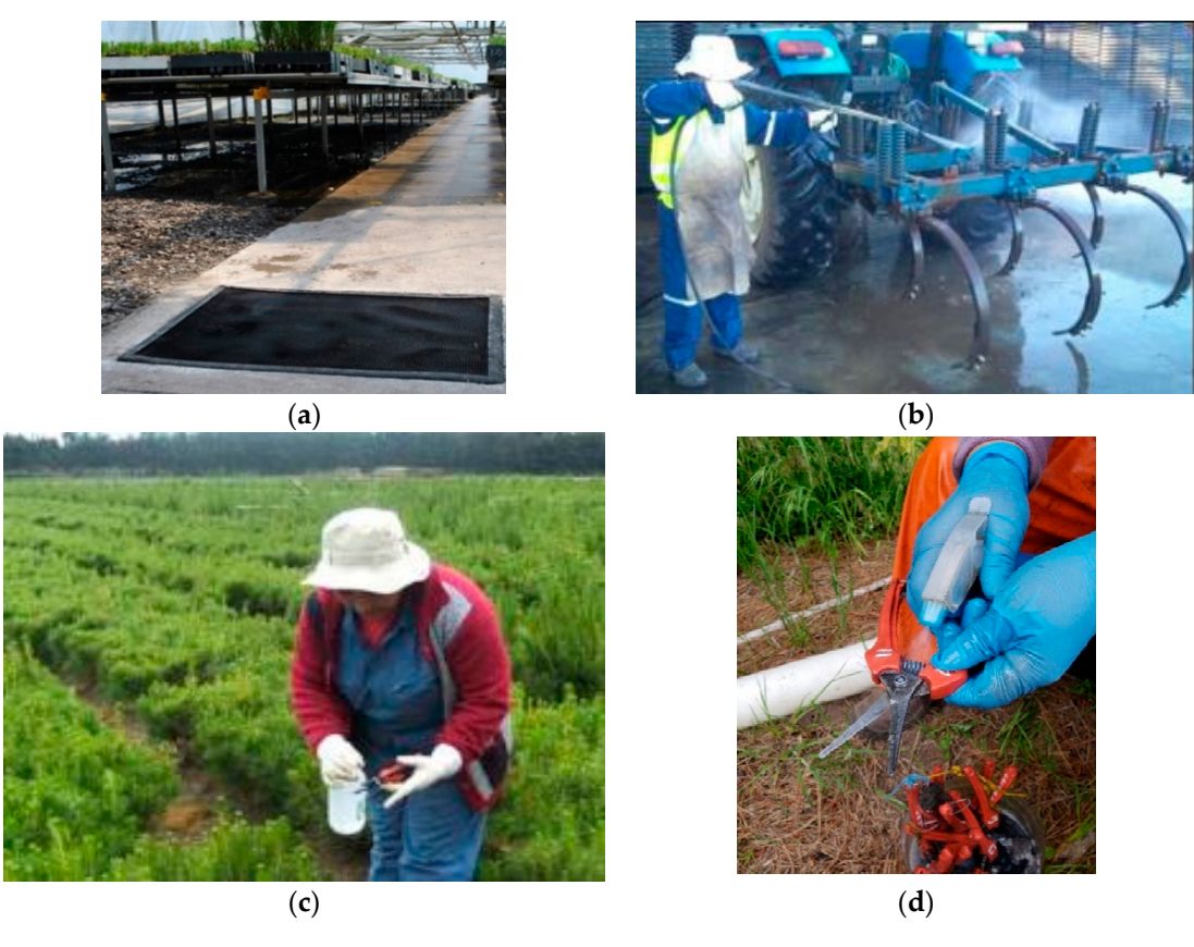
Figure 2. Management actions against Fusarium circinatum in Chile: (a) footbath; (b) disinfection of machinery with 70% ethanol; (c,d) glove and tool disinfection with ethanol.

Seedling nurseries may disseminate F. circinatum locally and regionally [66]. Sanitation practices are critical to avoid new infestations and spreading of the disease to the field. Removal or burning