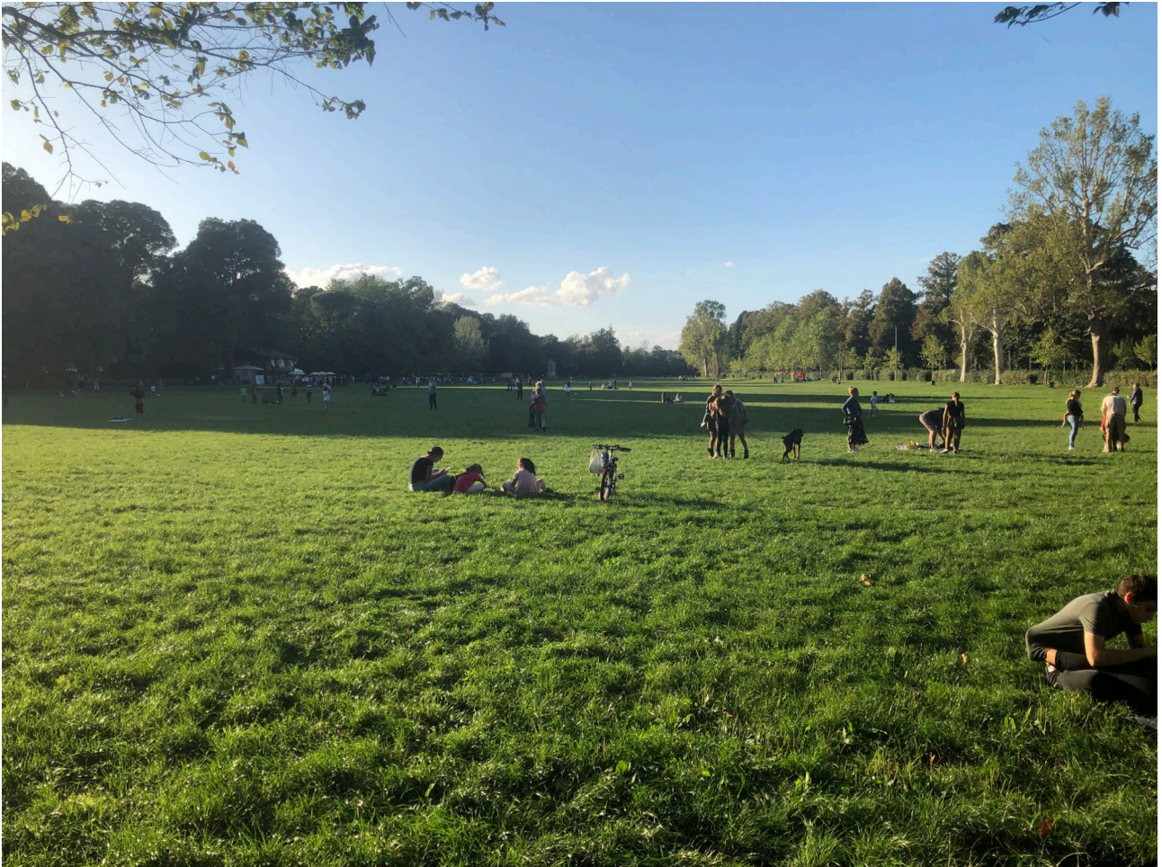
Fig. 1. Parco delle Cascine in Florence (Italy); A gathering and meeting place for many Florentine citizens.

It has been repeatedly stated that cities face major challenges for the quality of life and for the range of opportunities that they can offer to their citizens. Indeed, there is no doubt that metropolitan areas are, and will increasingly be, the engines of economic growth and fertile grounds for the development of technology, creativity and innovation (Colenbrander, 2016). They can also foster enlightened, congenial multicultural living and the “knowledge-based economy”, an expression coined by Peter Drucker (1966) to describe the use of information and knowledge in all its forms to generate value, with particular attention to nature, creation, diffusion, transformation and transfer of skills and culture.