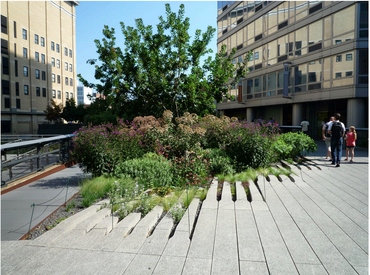
Fig. 2. High Line, New York. After the opening, the average rent for Chelsea apartments rose almost ten times faster than all of Manhattan. This forced many small businesses and middle-income residents out of the area. A typical example of green gentrification.

In this context, it should be emphasized that, in order to be successful, environmental actions should be not only technically effective but they must also respond to a series of conditions connected with sustainability that address the aforementioned contextual factors on a local scale and are adjusted to obtain the necessary impacts on a global scale. Furthermore, we believe that this specificity must be taken into consideration to evaluate the relative successes of concrete actions in specific contexts, which depend largely on different starting points.