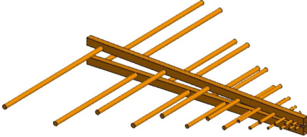
Fig. 3. CAD model of the LPDA antenna.

simulation reproduces the calibration of the manufacturer, which consists in the measurement of the insertion loss between the terminals of a pair of identical LPDA antennas placed in front of each other at 3 m distance (gain is then obtained through the Friis formula, and AF is obtained from gain).