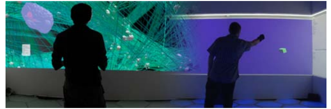
Figure 4: User interaction in the XIM.

The sentient agent, based on the Distributed Adaptive Control cognitive architecture [15], orchestrates the interaction between the user and the CEEDs application. It comprises an internal model of the user, and it possesses its own