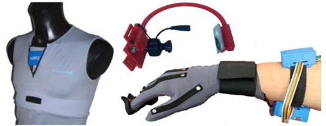
Figure 2: Newly developed wearable sensor devices. From left to right: e-Shirt, eye tracker and glove.

A multi-parameter sensing glove for the simultaneous acquisition of hand gestures and electrodermal activity (EDA) has been built [14]. Measuring both signals with a single sensor has the advantage that only one hand of the user is occupied, while the ergonomic design of the glove encourages natural movements and gestures. Both EDA and deformation signals are acquired and elaborated on-line by using the dedicated wearable and wireless electronic unit. The forearm orientation (in terms of Euler angles pitch, roll and yaw) is fixed in the dorsal part of the forearm close to the wrist. Finger position tracking is performed by means of textile deformation sensors. EDA signal acquisition is performed by using three electrodes made of conductive textile material on the index, medium and middle fingertip.