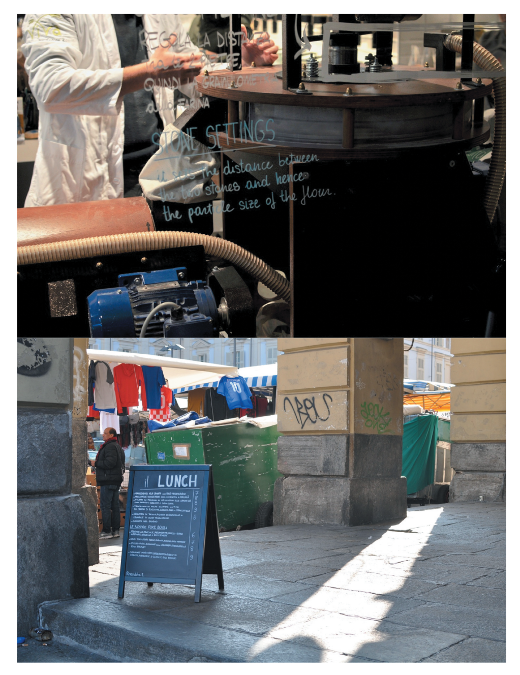
Figure 3. Above: "Grinding together the cereals" demonstration at Mercato Centrale. Below: "The LUNCH". The menu of a new eatery on Porta Palazzo.

the consumption of a distinct ethnic food. The construction of "Italianness" and the displacement of Barattolo's, predominantly non-Italian, vendours, manifest an environmental racism that penetrates food and its spatialities (Anguelovski, 2015; Slocum, 2007), and that might significantly contribute to the displacement atmosphere for consumers of color or/and foreign origins.