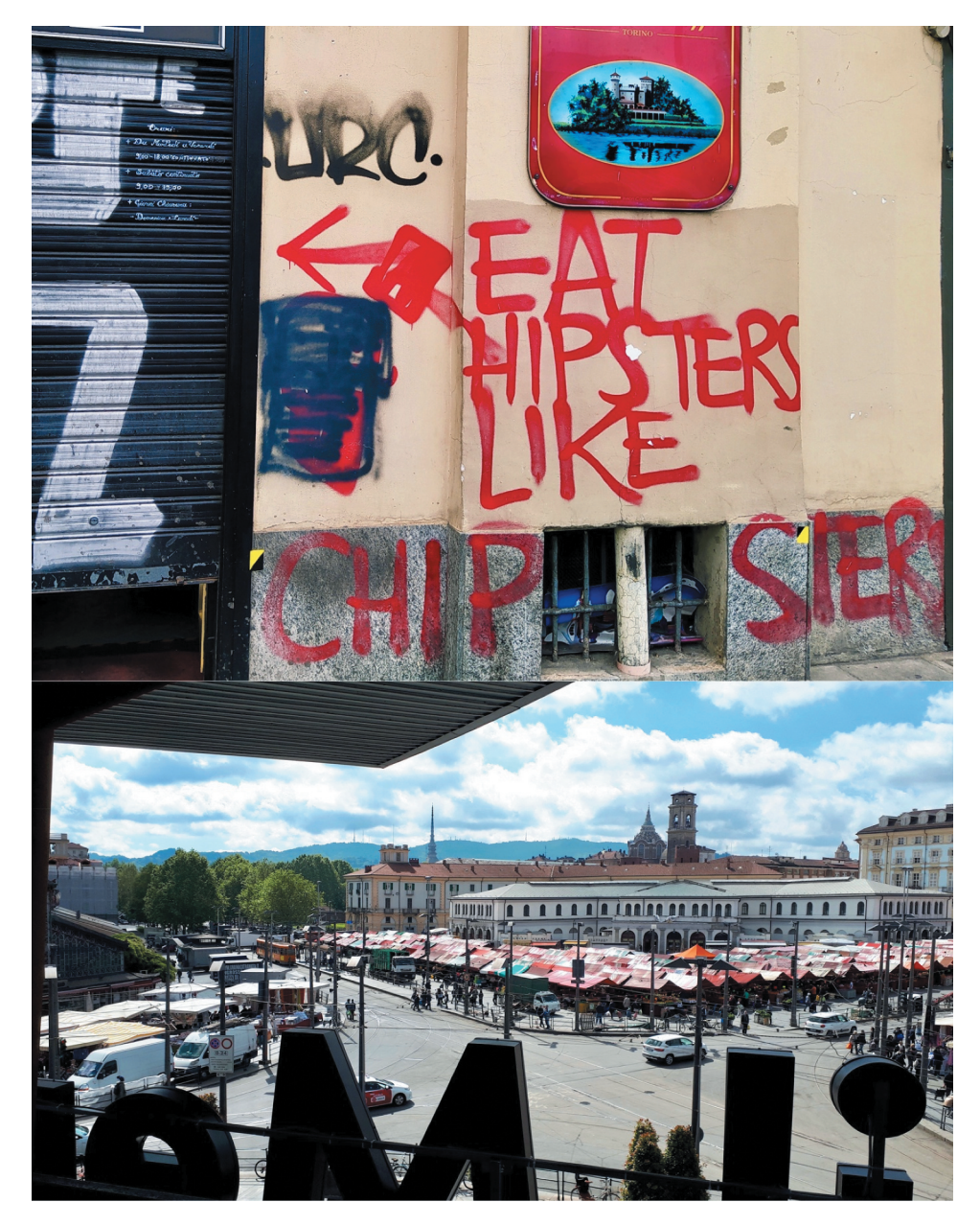
Figure 1. Above: "EAT HIPSTERS LIKE CHIPSTERS (an Italian chips' brand)". Writing on a wall of Porta Palazzo. Below: Partial view of the marketplace from the terrace of Mercato Centrale. Authors' pictures.

citizens to demonstrate against what is perceived as the ongoing gentrification of Porta Palazzo and northern Turin in general. To them, it marks symbolically and materially the direction and essence of Turin's gentrification: where to the process will proceed next (i.e. the north), and how (i.e. through food). A public discourse about food's gentrifying effects has been present before the brand's arrival. A theatrical project entitled Foodification: How food ate the city , a sarcastic story of food and urban transformations,