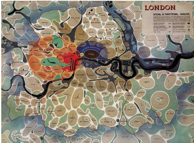
Figure 3.1 The London ‘living and organic communities’ as shown in Forshaw, John Henry and Patrick Abercrombie. County of London Plan . London: Macmillan and Co., 1943

purpose of the plan was to preserve the qualities of each community – Camden Town, Islington, Hackney, Battersea, Peckham, Greenwich, and so on – encouraging their independent and separate natures, inserting barriers like railways, green spaces and waterways, and preventing new roads from breaking them up. 22