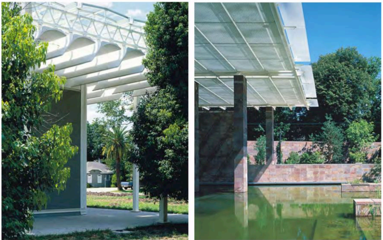
Fig. 11-12. On the right, the layered roof structure of the Fondation Beyeler in Basel as a reinterpretation of the Menil Collection's one, on the left (Renzo Piano Foundation, Genoa).

The Swiss art dealer Ernst Beyeler (1921-2010) was so impressed by the museum that a few years later requested Piano to design a similar building for displaying his collection in Basel. The same was for Raymond Nasher (1921-2007), for whom Piano designed a sculpture center in the downtown of Dallas, adopting the same strategy he set up in Houston: simple plans, closed walls along the streets, glass panels open to internal gardens or patios, dark floors, and a layered roof structure for conveying the exact amount of natural light that the works of art requested. A museum that does not impose its presence but rather disappears with discretion under the skyscrapers of the nearby downtown (Self, 2004).