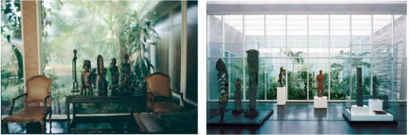
Fig. 3-4. The strict connection between the oceanic sculptures as displayed by Dominique de Menil in her house and by Renzo Piano at the Menil Collection (Renzo Piano Foundation, Genoa).