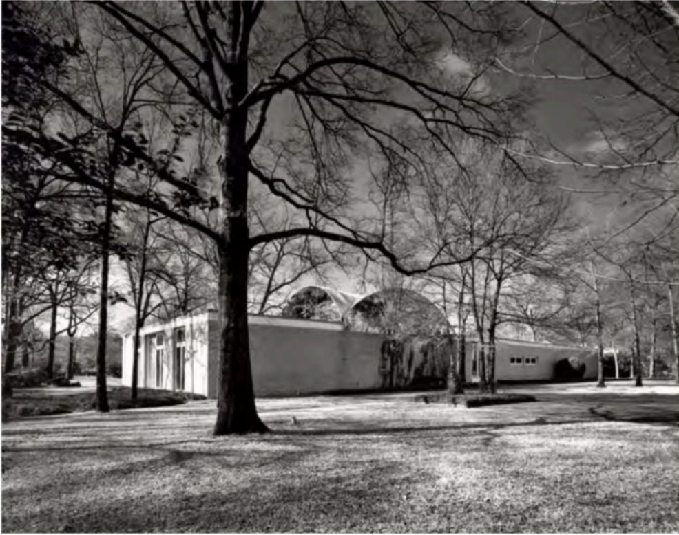
Fig. 2. The Menil House designed by Philip Johnson (Courtesy of the Menil Archives, The Menil Collection, Houston).

Dominique requested to the architect a single-story house, with the front to the north and a patio in the middle, in which she wanted to plant a series of lush vegetation reminiscent of the period that the couple spent in Venezuela during the war (Fox, 2010: 203). Moreover, she demanded some black inexpensive ceramic tiles for the floors, and generous glass walls toward the garden. The house is a rectangular volume, clad with red bricks, of approximately 50 per 21 meters, with flat roof and ceilings of 3,65 meters height. The private part of the house is confined in the rear and, after looking at the first version of the project, Dominique asked Johnson to avoid a dining room and to considerably enlarge the atrium, which became the veritable entrance gallery of the house, with works of Yves Klein, Giorgio de Chirico and René Magritte displayed on the walls. As a further demonstration of her clear ideas and independence from the architect, Dominique didn't request Johnson's advice for the interiors, instead hiring the fashion designer Charles James (1906-1978) for that purpose, and designing some of the furniture herself, as the heptagonal ottoman for the living room 1 .