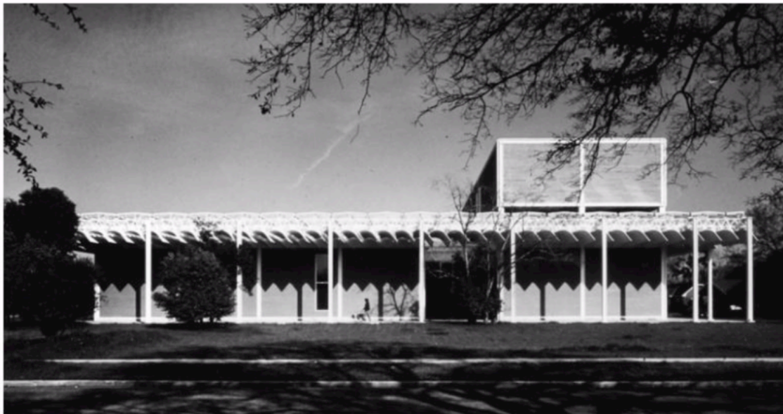
Fig. 10. The Menil Collection's ferro-cement leaves as a modern cornice (Renzo Piano Foundation, Genoa).

Piano refined the plastic-prefabricated roof structures he built during the Sixties and, with the advices of Arup structural engineer Peter Rice (1935-1992) and services engineer Tom Barker (1936-), adopted a slightly different solution for the Menil Collection. He fragmented the roof structure into a series of different and superimposed layers, carefully studying a "piece" for diffusing the light that could be mass produced and assembled on site. Those three hundred ferro-cement "leaves" represented the lower layer of the roof structure, hooked to ductile-iron reticular trusses that also bear the skylights on top 3 (Dal Co, 2014: 154-155). Here, for the first time, Piano adopted a strategy that will later become one of his signatures: charging the roof structure not only for functional reasons, but treating it as the aesthetic mark of the building. This was evident in the decision of posing the ferro-cement leaves inside and not outside the skylight, where the brises-soleil are usually placed. A choice that weakened the water-proofing of the skylights and trapped the heat inside the building, producing an extra-cost for the air condition. But, in doing so, this carpet of leaves is always visible from the inside of the galleries and the outside walkway along the external perimeter of the museum, as a modern reinterpretation of a Renaissance palace's cornice (Ingersoll, 2010: 227).