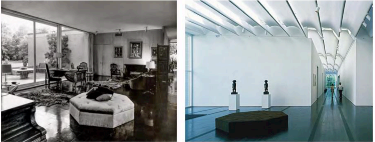
Fig. 6-7. On the left the ottoman designed by Dominique de Menil for the living room of her house and, on the right, the Menil Collection's lobby through the east corridor in his original setting, with a new version of the ottoman, again designed by madame de Menil (Courtesy of the Menil Archives, The Menil Collection, Houston; Renzo Piano Foundation, Genoa).

As in the Menil House, the museum's rectangular plan is fragmented by a series of patios and small gardens that convey all the possible views to the outside. At the ends of the central spine, two small gardens are cut out into the museum's side walls. And three similar oblong green areas are placed to the rear façade – in front of the staff entrance and the conservation workshop – and to the main façade, in front of and next to the main entrance. Finally, a small patio – with the same tropical plants that characterized the Menil House – is placed between the primitive art galleries. In particular, Piano focused his attention on the way of filtering natural light asked by Dominique de Menil. She experimented the changing beauty and delicate modulation of natural light during the design and the construction of the Rothko Chapel (1964-1971), along the same street where the Menil Collection was to be built (de Menil, 1970; Barnes 1989; Dohoney, 2019).