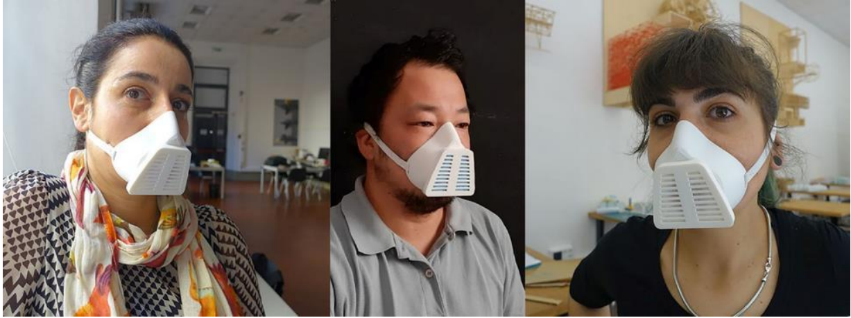
Figure 16: Verdiani, Giorgio, 'pictures taken during the test for wearability of a 3D printed mask'. 2020