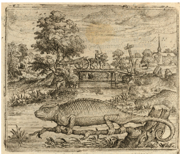
2 Marcus Gheeraerts, Chameleon, from Eduard de Dene, De warachtighe fabulen der dieren [...], 1567