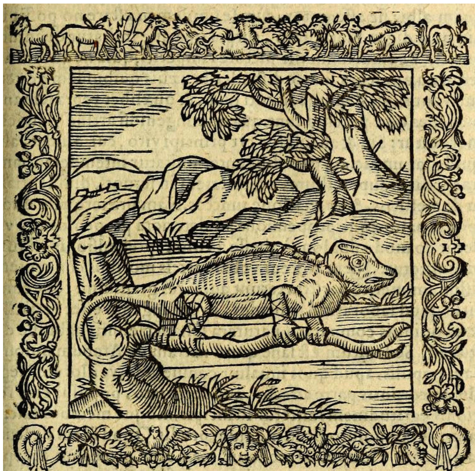
7 Chameleon, from Andrea Alciati, Omnia Andreae Alciati V.C. Emblemata , [...], 1589