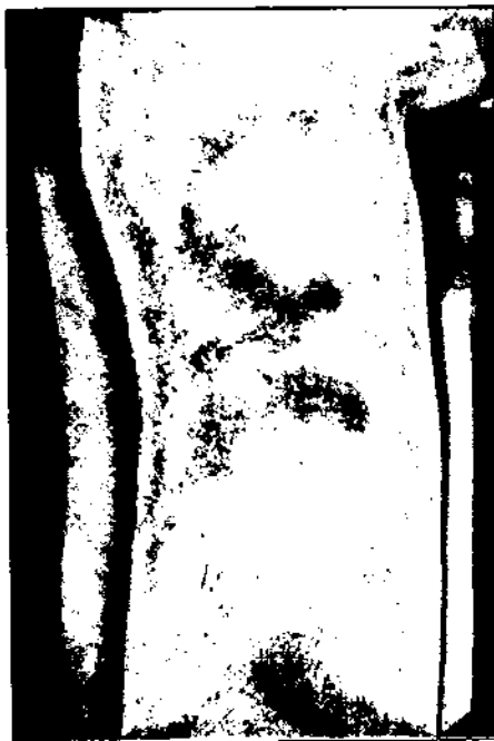
Figure 1. Large, non-elevated, indurated, slightly hyperpigmented plaque of the right arm (patient 21).