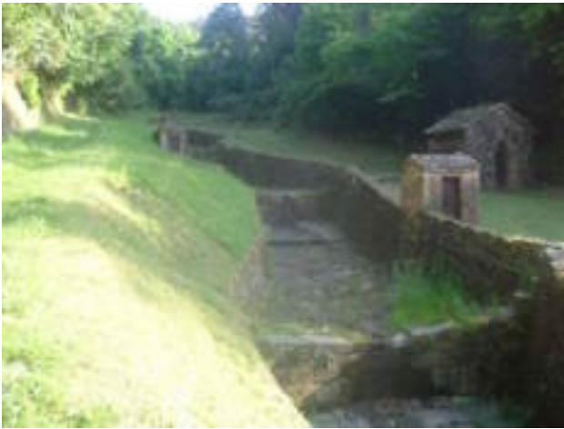
Figure 3. Lucca. Aqueduct. Upstream works. The paving depth of the river San Quirico.