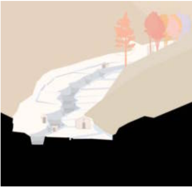
Figure 8. Lucca. Aqueduct.

Cross-section of the 3D model near the area of the sources.