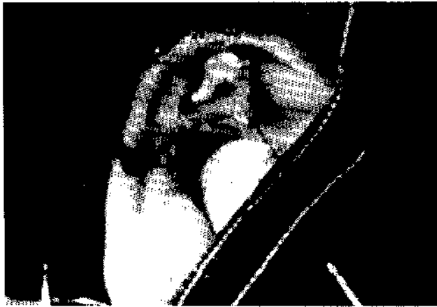
FIGURE 2. Tumor of the left auricle; note the kidney-shaped cystic recess.