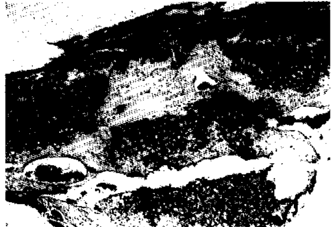
FIGURE 3. Tumor of the left auricle; histologic finding: see the hyaline cartilaginous tissue, rich in typical chondrocytes, with pseudocystic lacunae (low magnification).

On the basis of the data referred, we made a diagnosis of extraskeletal chondroma. The lesions are typically single, only exceptionally bilateral, 9 and are comprised of small tumors, usually hard, but sometimes tautly elastic with a cystic aspect. In about 2/3 of the cases, histologic examination shows