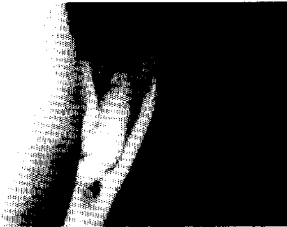
FIGURE 1. Tumor of the left auricle; clinical feature.

The tumor on the right pinna was solid and uniform in shape. These naked-eye aspects substantiated the different clinical appearance of the two lesions.