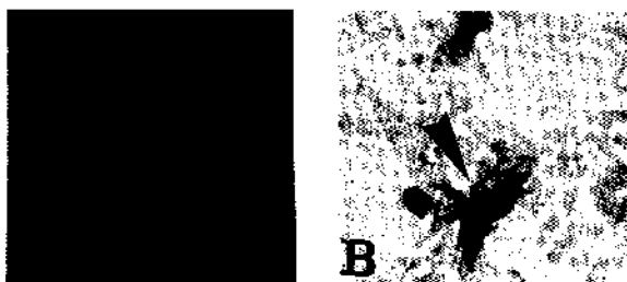
Figure 2. A, Perivascular dendritic cells stained by anti-CD36 monoclonal antibody ( arrow ) in the lamina propria of the tongue of an HIV+ subject (APAAP, magnification \times 400 ); B, UEA-1+ vessels ( arrowhead ) are shown in a serial section of the same specimen (immuno-peroxidase, magnification \times 400 ).

In this study, DC expressing CD36 antigen were found in the lamina propria and epithelium of the oral mucosa in both HIV- and HIV+ subjects. The numbers of these cells were not significantly different between the biopsies of the HIV- subjects and the clinically healthy mucosa of HIV+ subjects. On the contrary, the expression of HLA-DR by CD36+ DC was much lower in HIV+