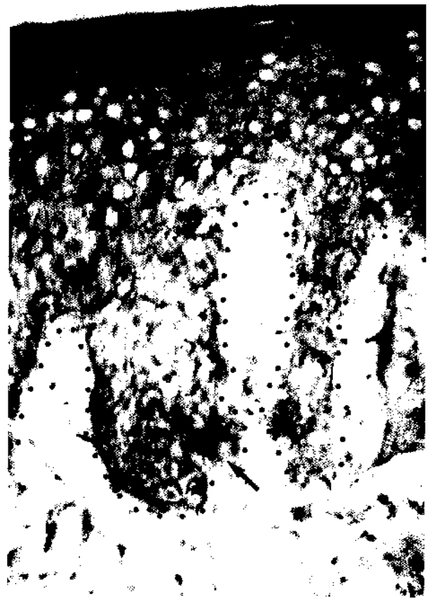
Figure 3. No cells stained by anti-HLA-DR monoclonal antibody can be recognized in the lamina propria of the clinically healthy lingual mucosa of a HIV+ subject; only one stained cell is visible in the epithelium ( arrow ) (APAAP, magnification \times 160 ).

These cells had an oval nucleus, with pale chromatin except for a thin peripheral rim (Fig 5). They contained some cisternae of rough endoplasmic reticulum, a few smooth tubules and vesicles, a prominent Golgi apparatus, and numerous dense, round, membrane-bound bodies, about 1 \mu\text{m} in diameter (presumably lysosomes). Few of these latter bodies were near the Golgi apparatus; instead, most were gathered outside the Golgi region. The content of these bodies was either homogeneous or included one or a few round densities, mostly located at the periphery (Fig 5).