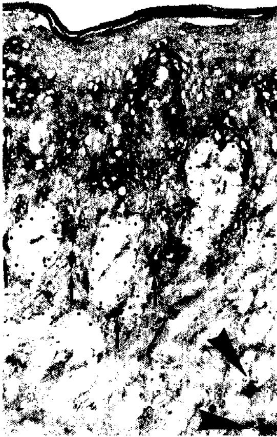
Figure 1. Dendritic cells stained by anti-CD36 monoclonal antibody are shown in the epithelium ( arrows ) and in the lamina propria ( arrowheads ) of the clinically healthy lingual mucosa of an HIV+ subject (APAAP, magnification \times 160 ).