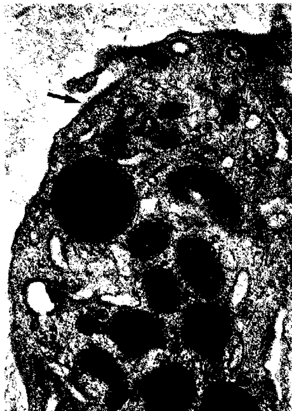
Figure 6. A perivascular dendritic cell showing a focal adhesion to the extracellular matrix (arrow); the thin filaments, the dense patch on the inner side of the plasma membrane, and the linear density in the extracellular space adjacent to the plasma membrane are clearly visible (electron microscopy, magnification \times 37,000 ).

in number to HIV - subjects. Consequently, our data cannot be assumed to support the hypothesis that CD36 + DC of the oral mucosa play a more relevant role as epithelial antigen-presenting cells in HIV + subjects than in HIV - subjects.