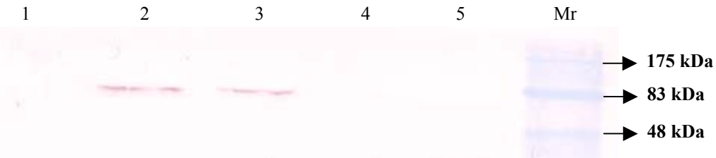
Figure 2. Western blot analysis of non transfected and transfected Cos-1 cells. Lane 1 (negative control) corresponds to non transfected COS-1 cells. Lane 2 (positive control) are COS-1 cells transfected with normal \beta -gal vector. Lane 3 corresponds to COS-1 cells transfected with mutated vector Arg482His. Lane 4 and 5 are COS-1 cells transfected with mutated vectors Tyr57 stop codon and Asp151Tyr respectively. Mr is the marker.

The c.171C>G transversion was expressed in COS-1 cells. COS-1 cells transfected with the mutant vector showed absence of the 85kDa precursor protein (Fig. 2) and no catalytic activity (Table 2). The 64kDa mature protein is absent in all preparations including the positive control COS-1 cells transfected with normal \beta -gal vector. It was previously shown that in COS-1 cells transiently expressing human \beta -galactosidase, the 85kDa precursor is poorly processed into the mature 64kDa protein (Oshima et al., 1988; Morreau et al., 1989). The lack of processing is thought to be due to the transfection procedure and the fact that the amount of endogenous protective protein available in COS-1 cells is not sufficient to stabilize the bulk of over produced \beta -galactosidase molecules.