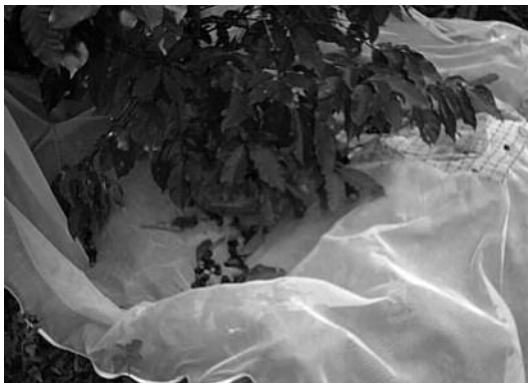
Figure 6 - Coffee fruits shaken off the tree and collected on the sheet