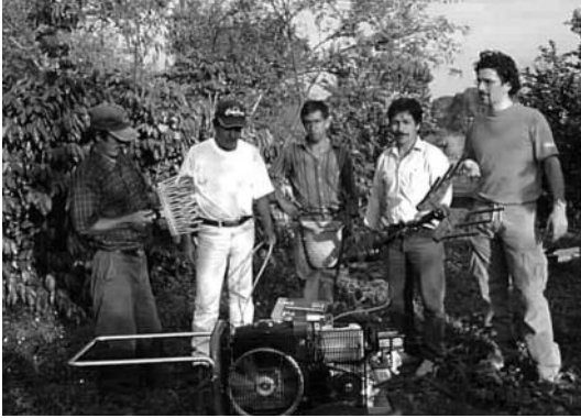
Figure 4 - Pneumatic equipment for coffee harvesting and other operations