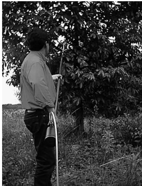
Figure 8 - Pruning of a coffee plant with pneumatic scissors on pole