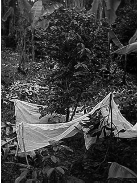
Figure 7 - Harvesting post in the estate of Roberto Escamilla, Chocaman, State of Veracruz