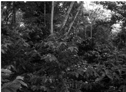
Figure 3 - Coffee plants in a typical Veracruz State establishment