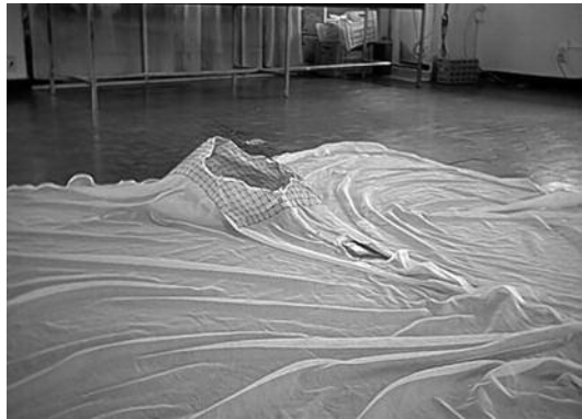
Figure 5 - Fruit collecting sheet with sack