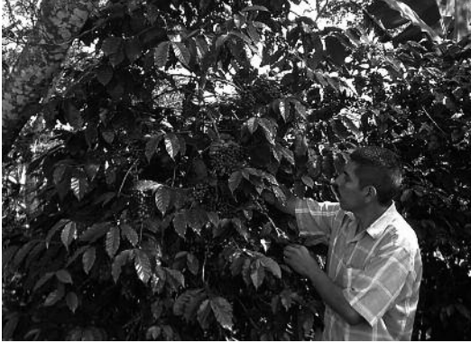
Figure 1 - Manual harvest on greatly developed Typica plants