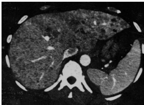
FIGURE 1 - Contrast-enhanced abdominal CT scan showing innumerable, hypo-attenuating various-sized focal lesions of the liver.

Abdominal CT scan was performed again 2 months after the previous one and this time it revealed multicentric, infiltrative nodules of the liver, of various sizes, mostly smaller than 1 cm (Figure 1), hypo-attenuating in all phases of the examination with unchanged thrombosis in portal, suprahepatic and inferior caval veins (Figure 2). A further ultrasound-guided random liver biopsy collected a sample of 29 mm in length, leading to diagnosis of poorly differentiated HCC. Only palliative care was achievable and the patient died of liver failure within 2 months.