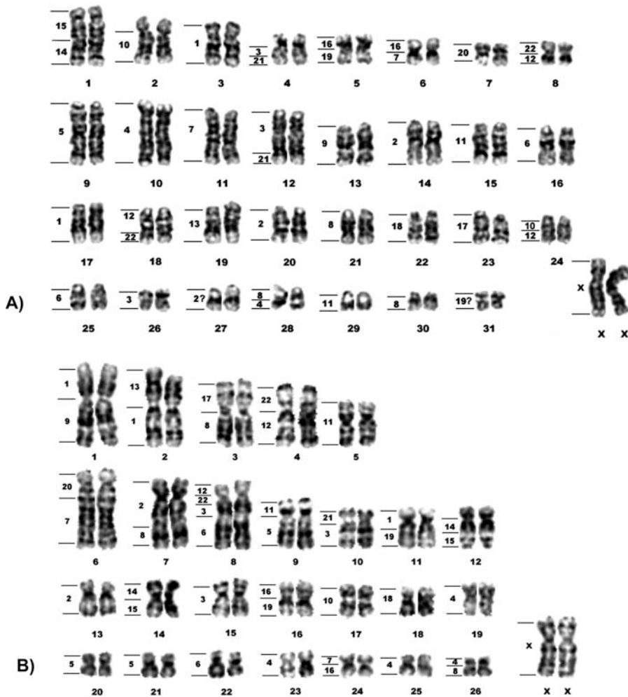
Figure 2. G-Banded Karyotype of Female Nine-Banded Armadillo and Female Lesser Anteater

(A) Female nine-banded armadillo D. novemcinctus ( 2n = 64 ) and (B) female lesser anteater T. tetradactyla ( 2n = 54 ).