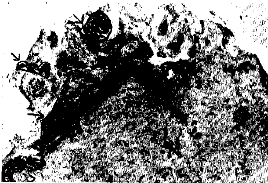
Fig. 1 - An example of SSM stained with 225.28; black areas consist of stained cells, except for the portions indicated by arrows where there are pigmented non-stained cells ( \times 80 ).