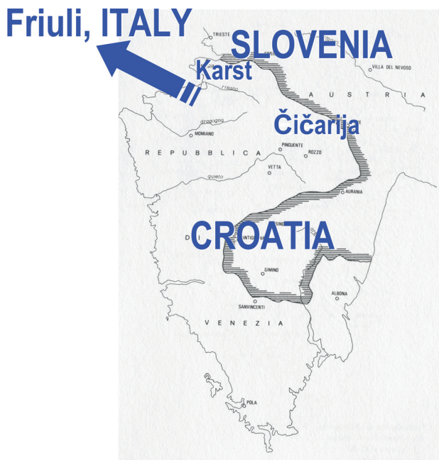
Fig. 1. Location of Istria (historical map showing the former border between the Republic of Venice and the Austrian empire).

Italian (which is spoken by even the oldest community members), notes were taken, and audio or video recordings were made of the interviewees when possible. All plants quoted during the interviews were gathered and identified following the standard works of the Italian and Istrian flora 4,5 . Voucher specimens were deposited in the Pharmacognosy Herbarium of the University of Bradford (international code: PSGB). Comparative analysis with our previously conducted study on the phytotherapy of the Istro-Romanians, as well as with other ethno-