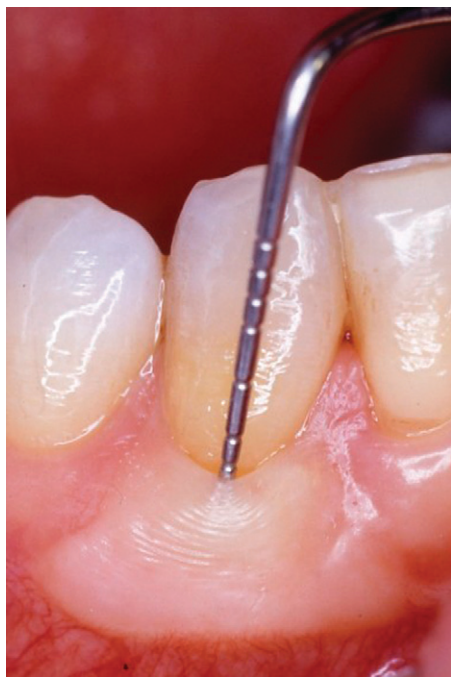
Figure 4. End of follow-up 23 years later (year 2006): increased KT associated with physiologic sulcus depth. Notice the coronal shift of the gingival margin.