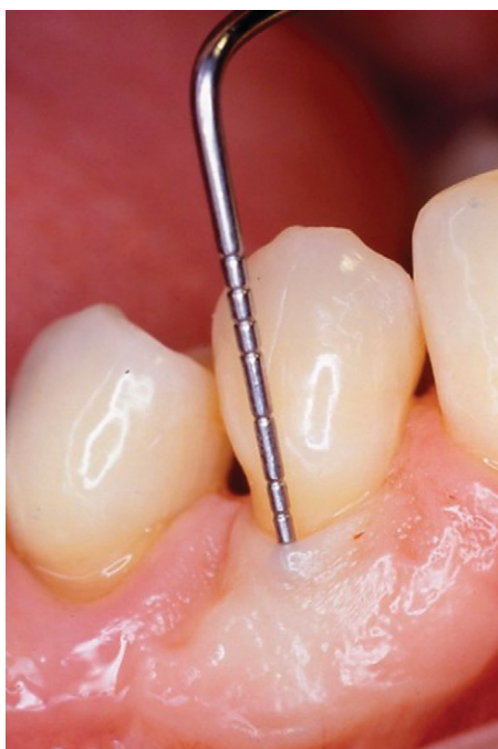
Figure 8. End of follow-up 22 years later (year 2007): increased KT associated with physiologic sulcus depth. Notice the coronal shift of the gingival margin.

From baseline, the overall mean recession reduction ( Rec_{T_0-T_2} ) was 1.4 \pm 0.9 mm, the mean amount of KT gain ( KT_{T_2-T_0} ) was 3.4 \pm 1.0 mm, and the mean PD change ( PD_{T_0-T_2} ) was -0.0 \pm 0.2 mm.