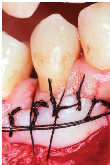
Figure 6. MFGG aimed to increase the KT width (year 1985).