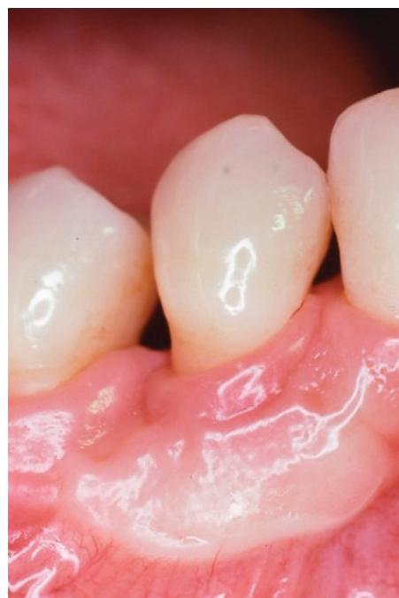
Figure 7. One year after surgery (year 1986): the amount of KT is increased.