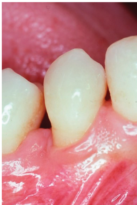
Figure 5. Mandibular premolar: gingival recession associated with an absence of attached gingiva.