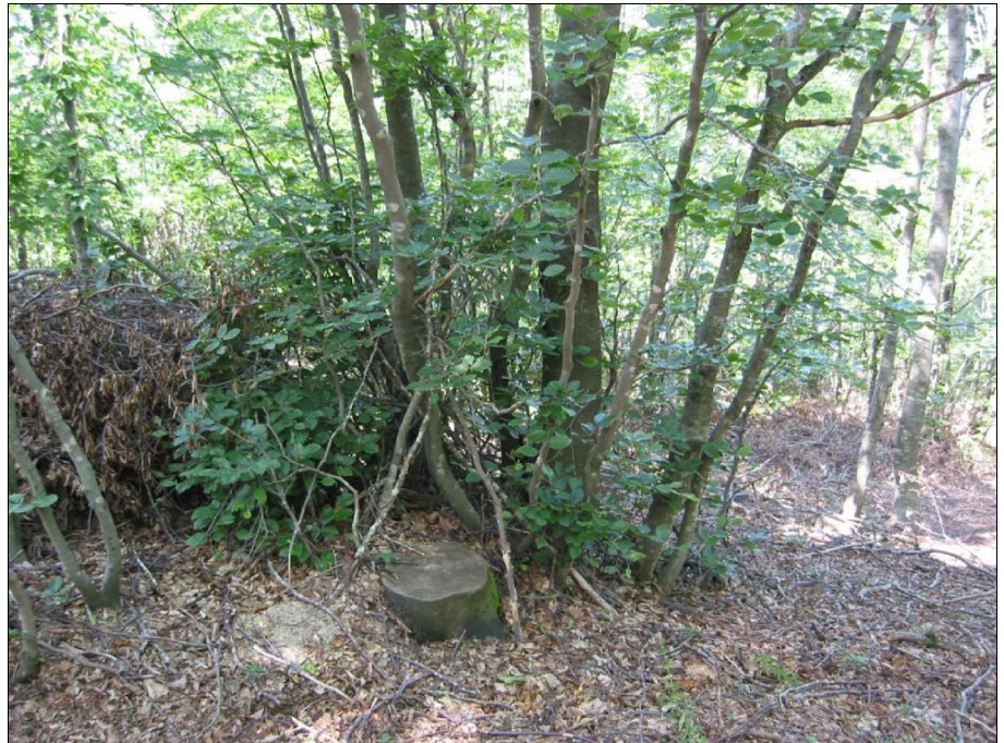
Fig. 3 - Beech selection coppice in the For-este Casentinesi, Monte Falterona and Campigna National Park (photo Nocentini).

caused by extensive fellings in the past century which practically excluded fir regeneration and favoured massive beech regeneration.