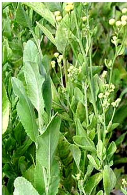
Fig. 2. Images of Balsamita major Desf, were obtained from the archives of Officina Profumo-Farmaceutica “Santa Maria Novella” Florence, Italy.