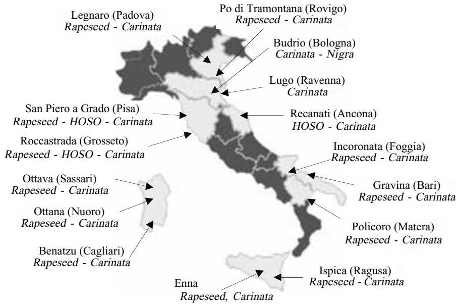
Figure 1. On farm trial locations of the "Bioenergie" project in the year 2007-2008.

farms, on a surface of at least 1 ha for each crop, applying common farm mechanisation methods, even if the trials and the results were evaluated also by a three-replicate randomised samplings. The trials were located in seven Italian regions: Veneto – Po di Tramontana (Rovigo); Emilia Romagna – Lugo (Ravenna); Marche – Recanati (Ancona); Tuscany – Roccastrada (Grosseto); Apulia – Gravina in Puglia (Bari); Sicily – Ispica (Ragusa) and Sardinia – Ottana (Nuoro).