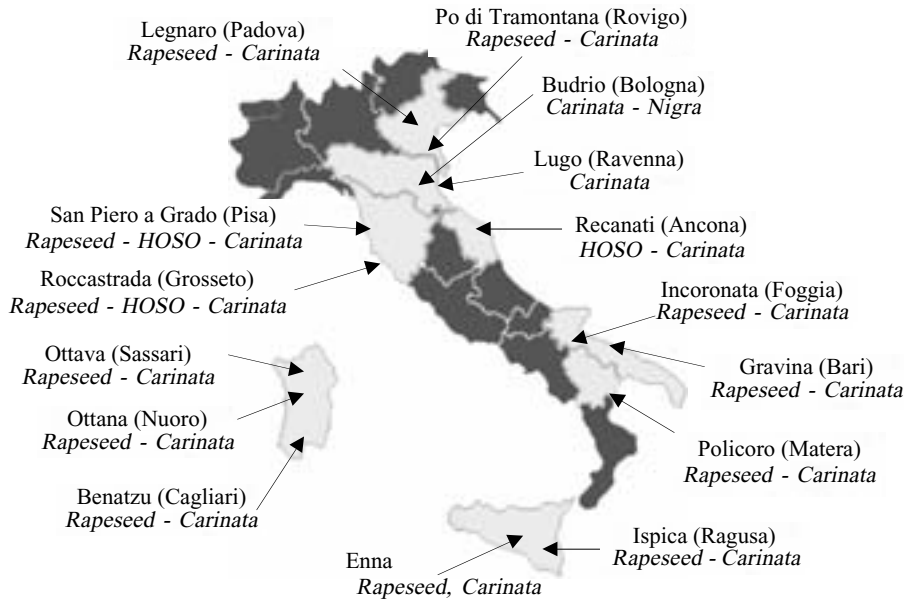
Figure 1. On farm trial locations of the "Bioenergie" project in the year 2007-2008.

farms, on a surface of at least 1 ha for each crop, applying common farm mechanisation methods, even if the trials and the results were evaluated also by a three-replicate randomised samplings. The trials were located in seven Italian regions: Veneto – Po di Tramontana (Rovigo); Emilia Romagna – Lugo (Ravenna); Marche – Recanati (Ancona); Tuscany – Roccastrada (Grosseto); Apulia – Gravina in Puglia (Bari); Sicily – Ispica (Ragusa) and Sardinia – Ottana (Nuoro).