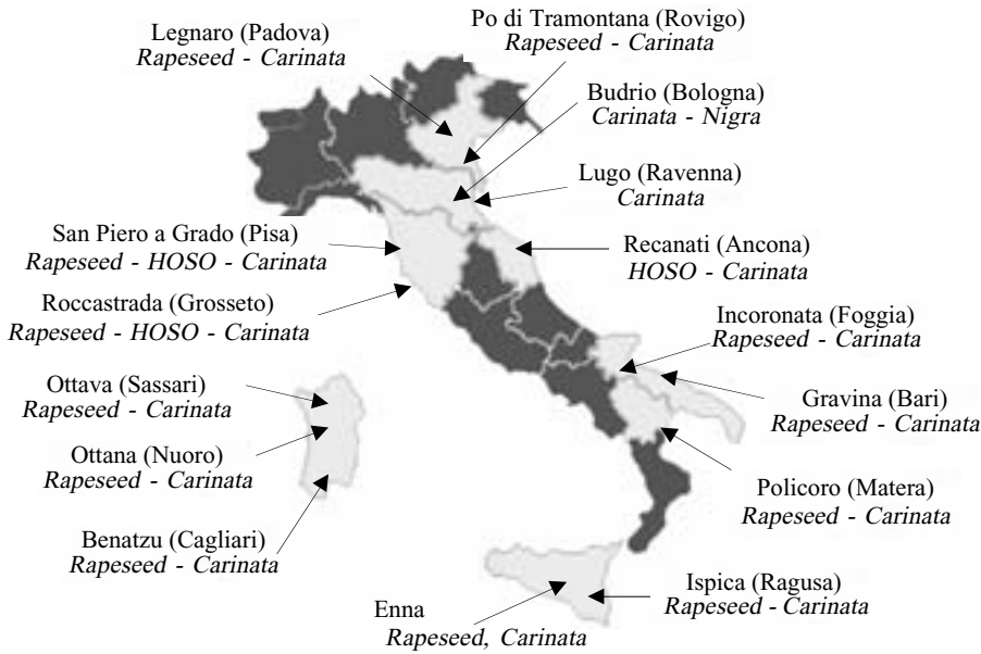
Figure 1. On farm trial locations of the “Bioenergie” project in the year 2007-2008.

farms, on a surface of at least 1 ha for each crop, applying common farm mechanisation methods, even if the trials and the results were evaluated also by a three-replicate randomised samplings. The trials were located in seven Italian regions: Veneto – Po di Tramontana (Rovigo); Emilia Romagna – Lugo (Ravenna); Marche – Recanati (Ancona); Tuscany – Roccastrada (Grosseto); Apulia – Gravina in Puglia (Bari); Sicily – Ispica (Ragusa) and Sardinia – Ottana (Nuoro).