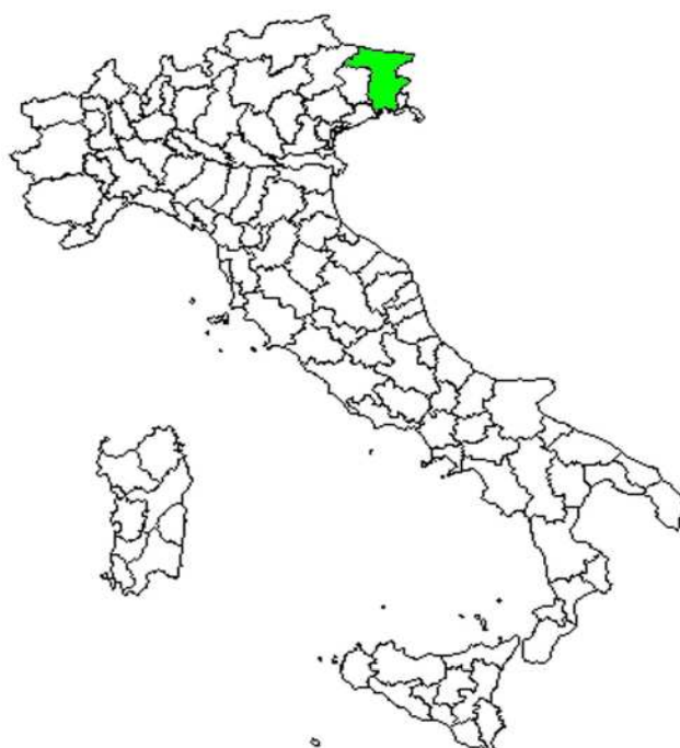
Fig. 3. Distribution in Italy of the indigenous crayfish Austropotamobius torrentium