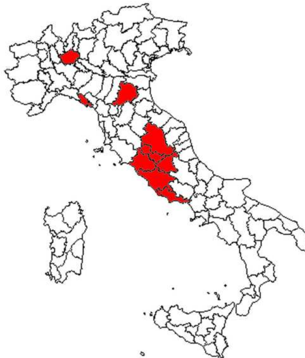
Fig. 7. Distribution in Italy of the non-indigenous crayfish Astacus leptodactylus