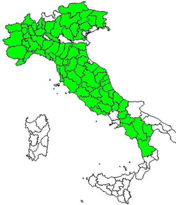
Fig. 1. Distribution in Italy of the indigenous crayfish Austropotamobius pallipes

occur in northern Italy, e.g. populations of A. i. meridionalis in the Province of Prato where instead populations of A. i. italicus typically live (Fratini et al. 2005).