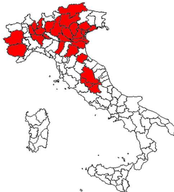
Fig. 6. Distribution in Italy of the non-indigenous crayfish Orconectes limosus

Finally, C. destructor and C. quadricarinatus seem to be still confined to experimental farms in central and northern Italy, while the marbled crayfish Procambarus sp., a parthenogenetic species and consequently potentially highly evasive, can easily be purchased in Italy from aquarists even through the commerce through internet. However, a reproductive population of C. destructor has been recently recorded in the Natural Reserve of "Laghi di Ninfa" in the Province of Latina (Scalici et al. 2009b) and at least a specimen of the marbled crayfish has been signalled in Tuscany (Foiano della Chiana, Province of Arezzo) within an abundant population of P. clarkii (Nonnis Marzano et al. 2009).