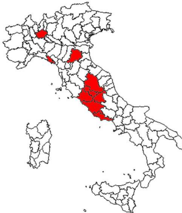
Fig. 7. Distribution in Italy of the non-indigenous crayfish Astacus leptodactylus