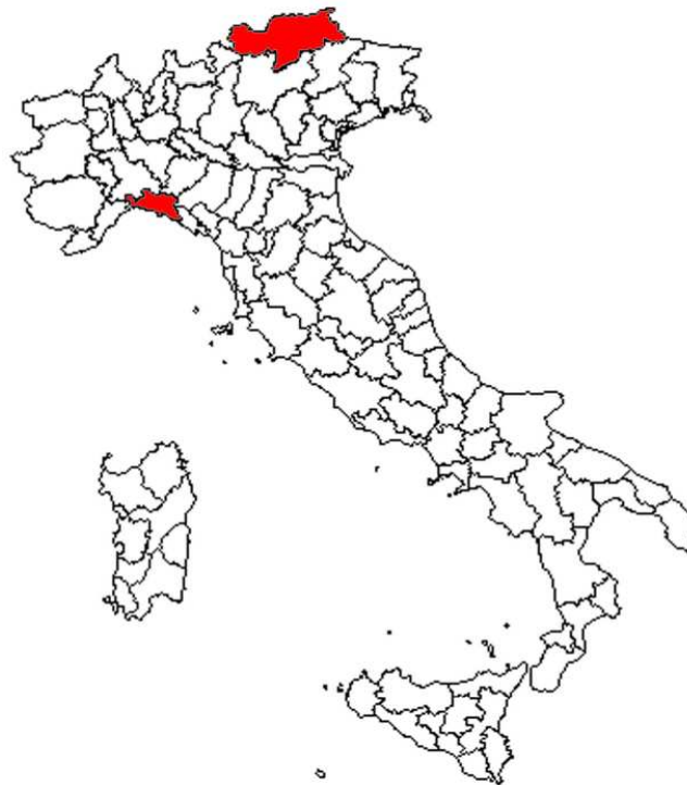
Fig. 8. Distribution in Italy of the non-indigenous crayfish Pacifastacus leniusculus