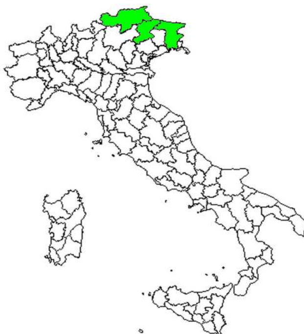
Fig. 2. Distribution in Italy of the indigenous crayfish Astacus astacus