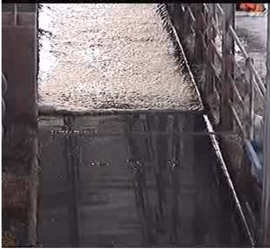
Figure 1. Flush wave on the clean freestall alley (barn 2).