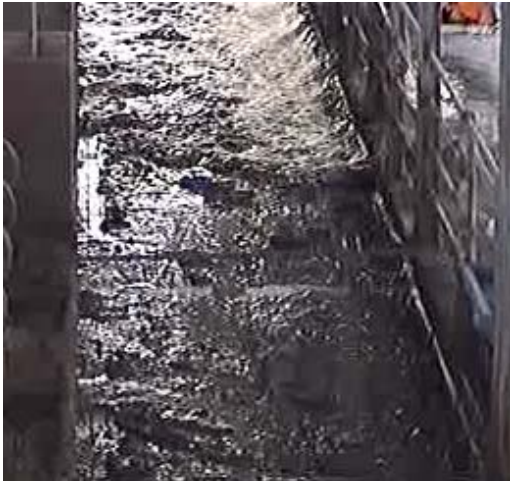
Figure 2. Flush wave on the dirty freestall alley (barn 2).