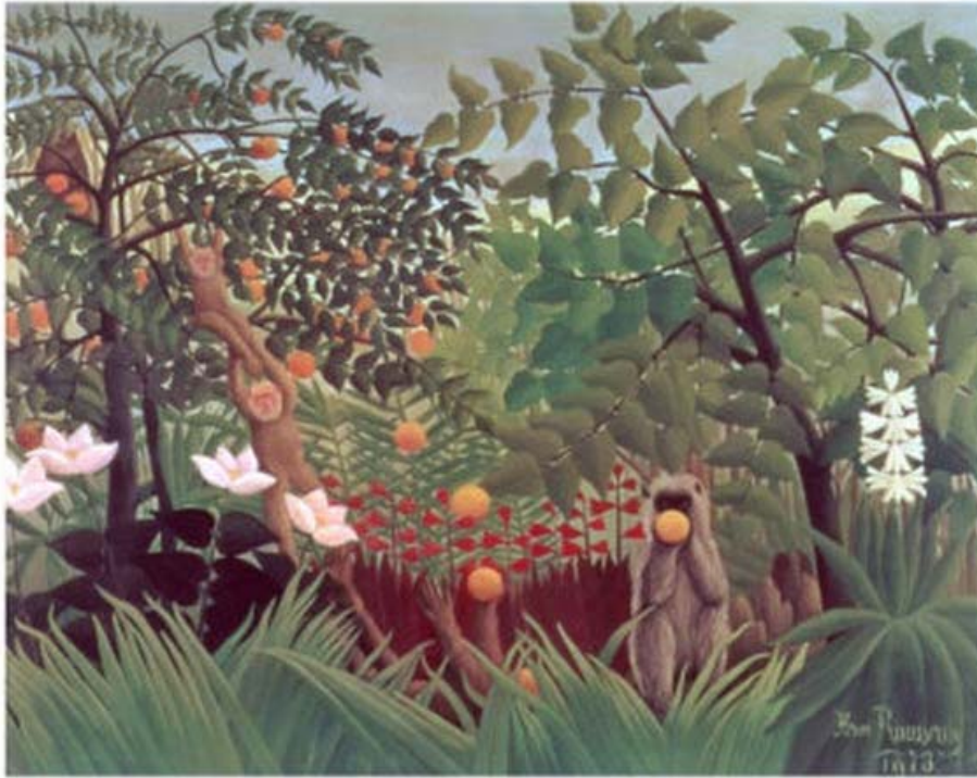
Figure 1: Henri Rousseau, “Exotic landscape”, 1910. The artwork ante litteram illustrates the concept of “biodiversity”.