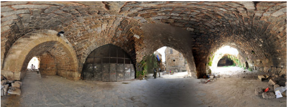
Fig. 5. Spherical panorama inside the vaulted galleries (Citadel of Tartous)

D. Panoramic Images. The images were organized in a database managed by Adobe Lightroom 3. This software allows the images to be catalogued using metadata, i.e. series of information connected to the files containing the images. Some of this information is memorized when the photo is taken, such as the date, the type of camera used, the lens focus, the time and the diaphragm. Other information can be defined subsequently by designing a suitable thesaurus. About 60 keywords have been identified for cataloguing the images belonging to this project which means it is now possible to undertake detailed research within the database. This method of management has made over 30 GB of photographs accessible to the various members of the work group and will also make it possible for researchers outside the WP4 group to rapidly find images. The position from which the photos were taken is also known thanks to the GPS system connected to the camera. This type of information, known as geotagging, facilitates the use of these images allowing them to be managed in innovative ways such as classifying them on the basis of geographic proximity. The elaborated panoramas (Figure 5) can be used in various ways: to enable the use of inter-connected virtual spaces on the internet or on CDs; to integrate chromatic information with the points cloud; in pairs for photogrammetric restitution (spherical photogrammetry).