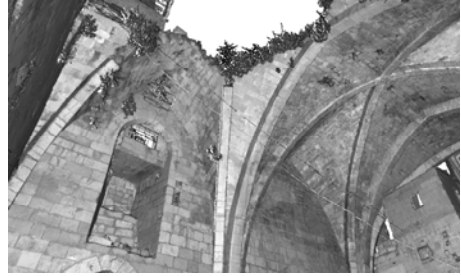
Fig. 4. 2D image of the total points model of the Knights' Chapel

The capacity of 3D models to remain unaltered over time and their interactivity, which allows users to extract information (2D and 3D), makes such models ideal instruments for setting up virtual museums which popularize and explain the museums' contents. But this is only one of their possible applications. As these models possess the fourth dimension, time, they introduce a dynamic element to both representation and comprehension. This factor is extremely important as it provides a method for checking historical reconstructions and for representing morphological transformations.