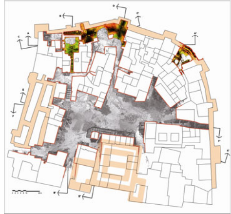
Fig. 2. Integration of the existing plan of the present situation and the plan extracted from the points cloud

This peculiarity, intrinsic to laser scanner data, has many positive uses for both research and for setting up multimedia instruments for popularizing, promoting and explaining the project to different user categories).