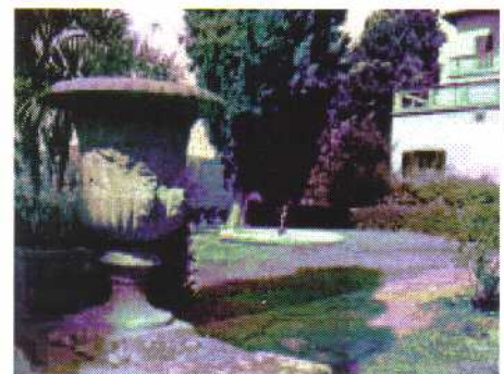
CISL – National Study Centre, Florence (Conference venue)

The conference involved 150 scholars from all over Italy, from academic institutions, national (Ministries), and local institutions (Regions and Cities), and civil society organizations. A big and well-qualified research delegation from ISTAT participated, testifying to the relevance of the meeting. The meeting was joined also by Italian researchers working abroad (Ireland, Finland, Switzerland), who found the conference a valued opportunity to get in touch with colleagues living and working in Italy. Statisticians, sociologists, psychologists, (Continued on next page.)