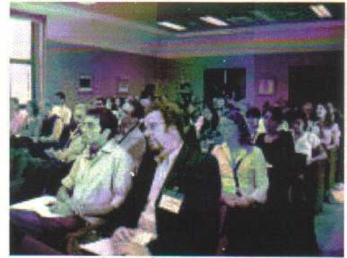
A picture from the meeting.

More information about the conference [in Italian]: http://www.statistica.it/qol