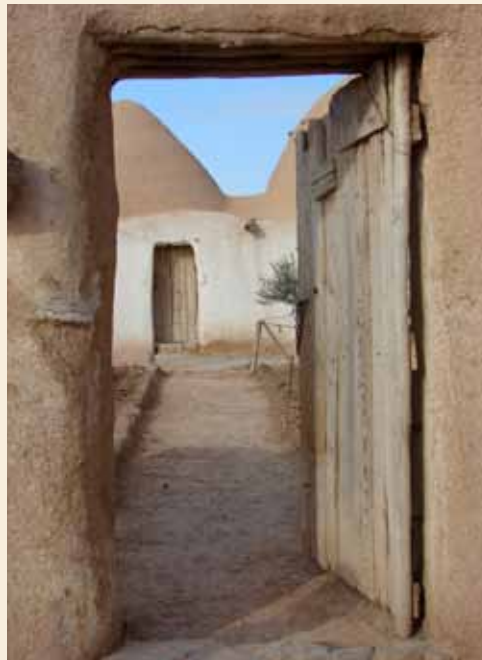
Fig. 4: Bab, South Aleppo.

A door or portal, often made of timber, sometimes we find a stone nearby to extend washed clothes on.