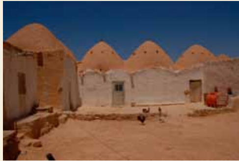
Fig. 1: Al-Baedar, Idlib (Giobas)

A place where fruit is collected to be ingathered, this term is used in earthen architecture villages and rural contexts.