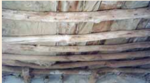
Fig. 25: Khashab Tabak, Al-Qameshli

Flat wood used in wooden traditional roofs, set on 'Khashab barm'.