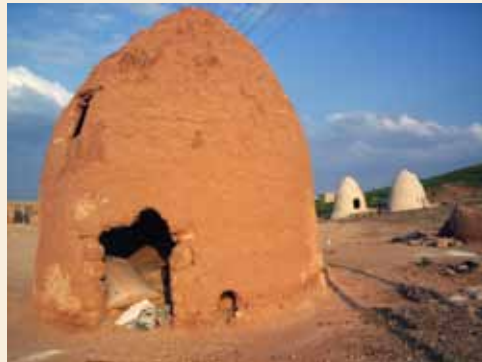
Fig. 33: Matban, Idlib (Giobas)

Sotre, for keeping straw. When it has a traditional flat roof, there is a hole in the ceiling named Afa'a used to pour the straw through.