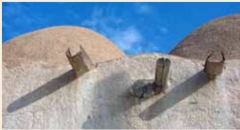
Fig. 37: Mezrab, South Aleppo

Canal, extending some distance from a roof, made of iron or occasionally made of stone in richer houses.