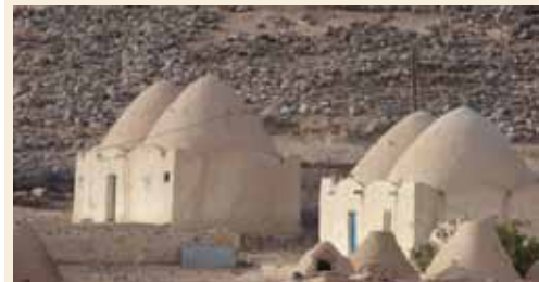
Fig. 7: Dar, South Aleppo

A house or home, which can be built from mud or stone or both.