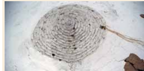
Fig. 20: Hawwara, South Aleppo

A solution of white fragile stone dipped in water for three days until it emulsifies, sprinkled then on mud walls as a form of plaster, sometimes used as a first layer under the lime plaster to strengthen earthen surfaces.