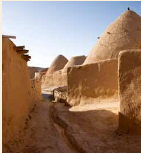
Fig. 60: Zuqaq, Al-Qameshli

Urban term meaning alley, which in Syrian earthen villages are not asphalted.