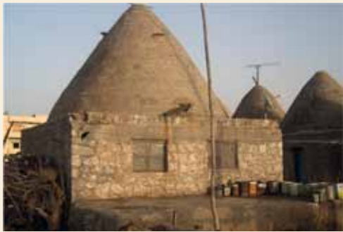
Fig. 9: Dekkeh, Ar-Raqqa

Interior or exterior bench, often built of mud and stone, plastered with earthen or cement mortar, large or small.