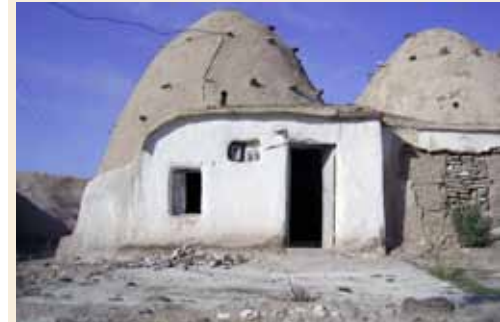
Fig. 48: Qubba, South Aleppo

Dome, built with adobe blocks, mud-stone or cob technique, having many shapes and may be true or false depending on its shape and courses.