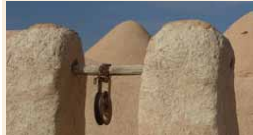
Fig. 6: Be'er, South Aleppo.

A well sometimes with the upper part built from stone or from mud and stone.