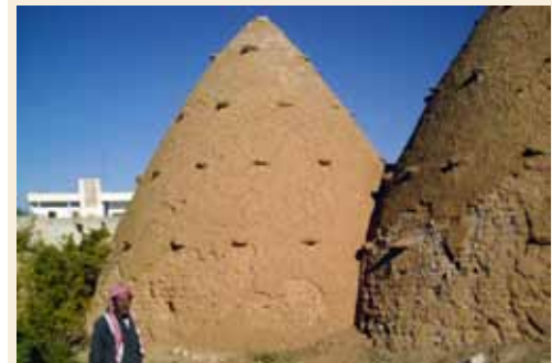
Fig. 13, Fallah, Hama (Salamiyah)

An inhabitant of a village (Karea), building his earthen house by himself with the help of his parents or neighbors, hiring a mason (Memar or Muallem) for the building of mud domes.