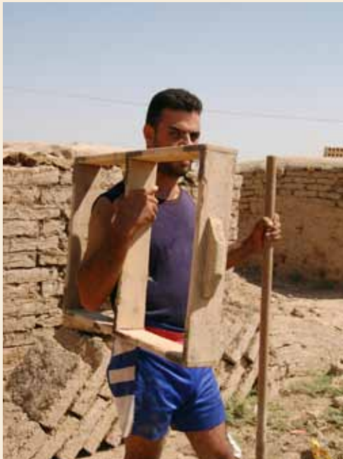
Fig. 51: Sane', Al-Qameshli

A person who works with a mason 'memarje' or 'muallem', sometimes making adobe.