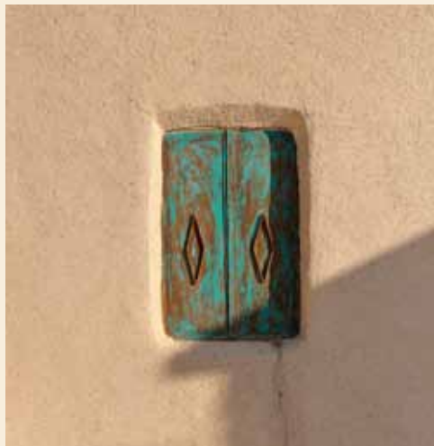
Fig. 40: Nafeza, Aleppo (Habbuba)

Windows, having many shapes in mud architecture.