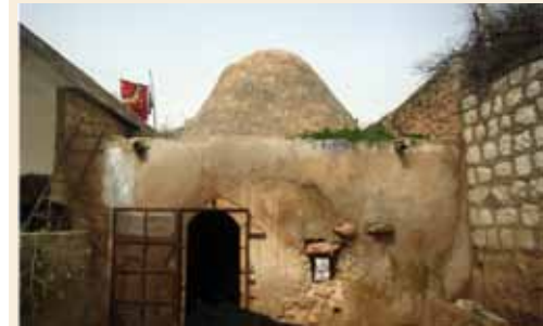
Fig. 21: Hazera, Idlib (Kelli)

A room where animals are kept, in some regions it is called 'Qabu' or 'Zribeh'.