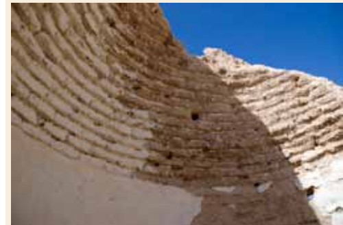
Fig. 35: Medmak, South Aleppo

A course of earthen blocks used in walls or in mud domes; it has a round shape in domes, earthen bricks situated horizontally in the conic domes, and inclined in the round. This term means an instrument to compact earth in other regions, such as Ar-Raqqa, while the same instrument is called 'Duqmq' in the region of Aleppo.