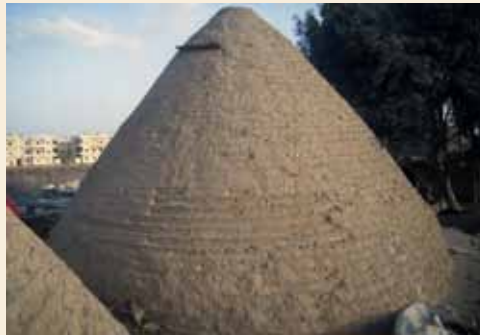
Fig. 52: Saqf, Ar-Raqqah

Ceiling, earthen houses have many forms, inclined (in one or two directions), flat or domed roofs.