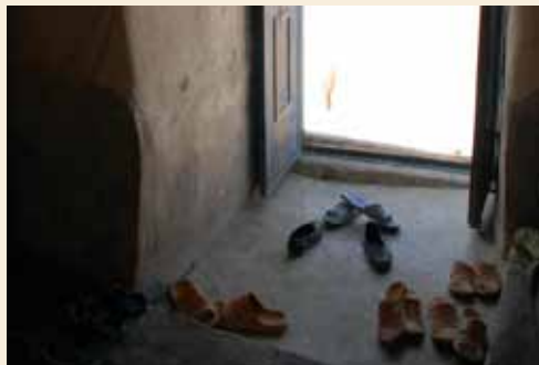
Fig. 2: Attabeh, Idlib (Mardeekh)

A delimited part of the floor, on a lower level than the room, at the door used to deposit shoes, often we find a pot of water (Al-Khabia) nearby, sometimes used by poorer people for bathing purposes.