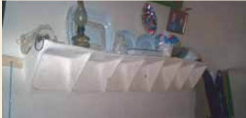
Fig. 50: Raff, Idlib (Mardeekh)

Gypsum or mud shelf on earthen walls in houses, of many different shapes and figures, sometimes rich in decoration.