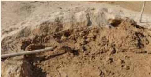
Fig. 57: Teen, Aleppo (Saint Simon)

Clay-mud, used in all construction techniques.