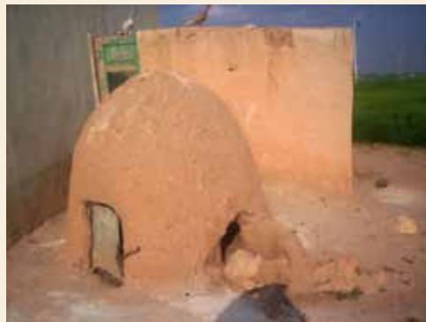
Fig. 46: Qunn, Idlib (Mardeekh)

A place where hens are kept, it can be considered as a typical part of mud or rural houses.