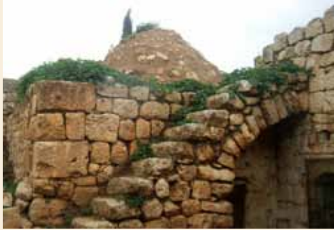
Fig. 8: Daraj, Aleppo (Saint Simon)