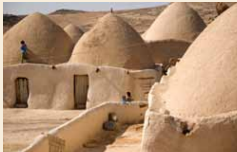
Fig. 53: Sur, Al-Qameshli

Mud boundary or wall, it is usually high enough to prevent animals or strangers from entering a house. It is not high enough for privacy, this role being less important than in the cities.