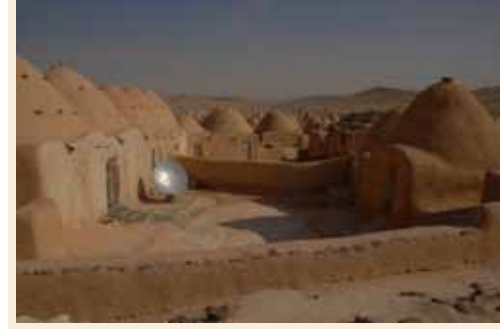
Fig. 19: Haush, South Aleppo

A space exists in mud or rural houses open to sky surrounded by boundaries or walls which protect the house from animals and strangers, sometimes there is an independent 'haush' used to lodge animals situated near a stable called 'Hazera', 'Zribeh' or 'Qabu'.