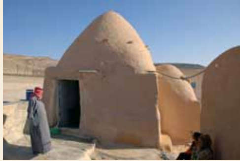
Fig. 15: Gurpha, Ar-Raqqa

A room, may be for guests (Deuf), living (Mae'sha), sleeping (Naum), this room may be domed or non-domed, and sometimes it has multiple functions at the same time (living, sleeping, etc.).