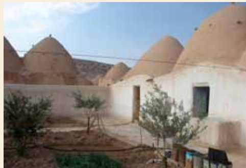
Fig. 17: Hakura, South Aleppo

Interior garden surrounded by boundaries, situated in front of the earthen rooms or behind them.