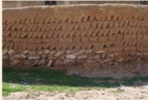
Fig. 3: Asas, Aleppo (Habbuba)

A base composed of mud and small stones. Sometimes lower parts of earthen walls are constructed with stone, and are thereby well protected from the rain.