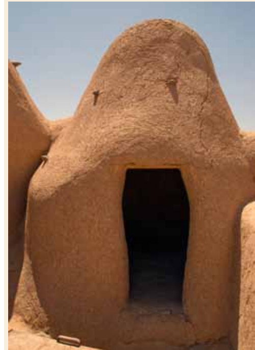
Fig. 49: Qubbia, Idlib (Giobas)

Small earthen domes, used to keep lumber, to conserve fruit and food or to store straw.