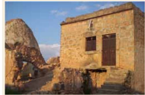
Fig. 12: Elleah, Idlib (Giobas)

Large room situated on the first floor or higher level, built from mud or stone particularly used in summer or for guests.