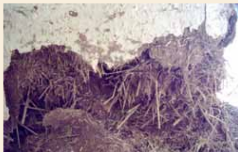
Fig. 47: Qesh, Al-Qameshli

Long pieces of straw, always used with mud mixture and employed to produce adobe blocks. Straw is mostly used with mud plaster.