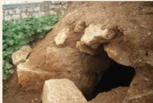
Fig. 16: Hajar, Aleppo (S. Simone)

Stones, used in different elements of mud houses (base, wall, etc.), their shape and volume depends on construction technique (mud-stone, etc.), there are two main types of it used in mud houses: basaltic called 'Hajar Bazelti', and calcareous called 'Hajar Kelsi'.