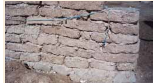
Fig. 28: Kehla, Al-Qameshli

Mortar Joint, the layer of mortar between mud blocks (See Fig. 27).