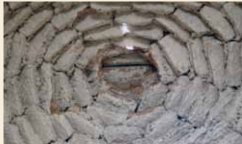
Fig. 45: Qefl, Hama (Salamiyah)

A stone at the top of a dome, usually placed on the final blocks which close the dome, having the structural functions of protecting the top of the dome and keeping all the courses together, with also an esthetic, traditional role. When a mason completes the dome structure he does not descend until he has received a tip from the owner.