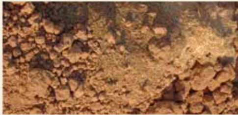
Fig. 56: Tebn, Idlib (Giobas)

Straw used with mud plaster or in earthen bricks.