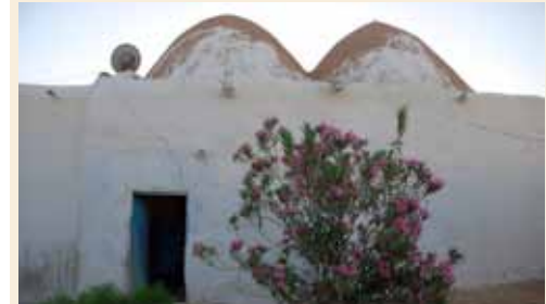
Fig. 29: Kels, Idlib (Mardeekh)

Lime, the procedure of mud wall painting is named 'Taklees'. Sometimes people plaster the whole facade with lime plaster or only around the doors or windows.