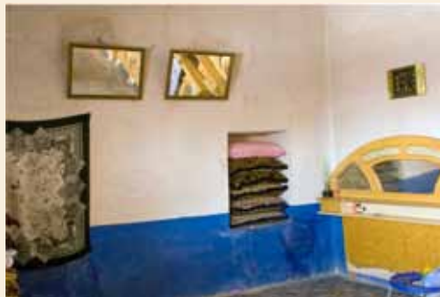
Fig. 26: Khezana Gedaria, South Aleppo (Al-Wdehi)

A rectangular or square hollowed shape in mud walls, used to store many things depending on the room: bedroom (cushions, covers, etc.), kitchen (dishes, spoons, etc.).