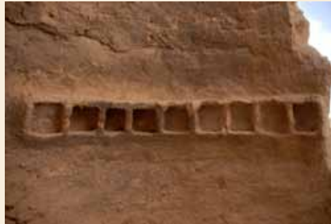
Fig. 32: Matbakh, South Aleppo