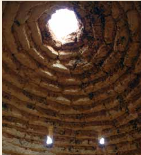
Fig. 18: Hamam, South Aleppo

A bathroom, has many types of roofs: traditional (flat) and, rarely, earthen domes which have small holes.