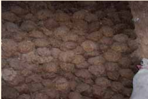
Fig. 23: Fashfash, Idlib Region