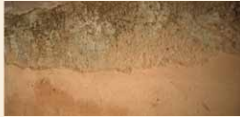
Fig. 59: Zreeqa, Idlib (Kelli)

Plaster, mud-straw mixture used as wall covering, in richer houses the plaster can be of lime.