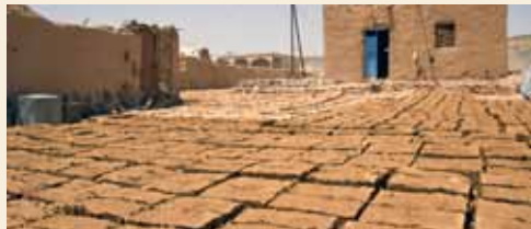
Fig. 30: Lebn, Hama (Salamiyah)

Local name of sun-dried brick or 'adobe', it is called sometimes 'lebn trab' to distinguish it from stones 'Hajar' or cement blocks 'Qarmeed', its size varies regionally.