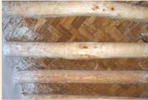
Fig. 24: Khashab Barm, Aleppo (Habbuba)

Trunks used to support a traditional roof. In cross-section always round, or nearly so.