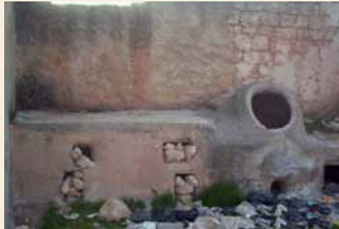
Fig. 39: Mustauda' Hatab, Idlib Region

Timber store, a place where people put wood for cooking or for storage in winter. Sometimes this place is used as a kitchen by poorer inhabitants, in other cases it is a very small store used particularly to provide the 'Tannur' earthen oven with wood.