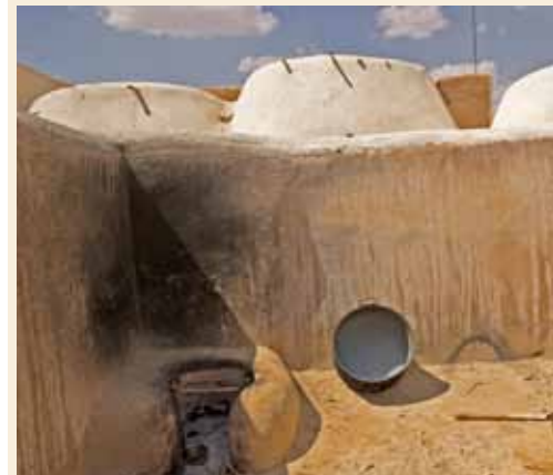
Fig. 55: Tannur, Rasm al Bugher

Traditional oven to bake bread. Women always construct it with a mixture composed of mud, terracotta and some local dried grasses, includes a large hole through which dough is inserted. Open skywards (horizontally) or vertically.