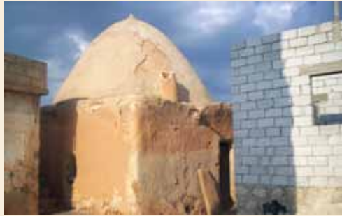
Fig. 43: Qarmeed, Idlib (Mardeekh)