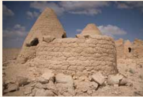
Fig. 10: Dewar, earth, Meksar Shamlei, (Hama)

A earthen construction technique used in Syria, very similar to the cob technique, made by building an earthen dome with loam courses, two each day until the entire dome has been completed: one in the morning and a second in the evening to permit good drying.