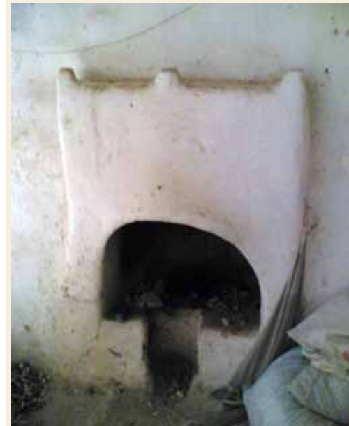
Fig. 34: Mauqed, Idlib region

Fireplace, situated in the middle of a mud room or at the corner, sometimes there is a simple open 'mauqed' in the kitchen for cooking.