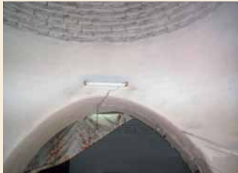
Fig. 44: Qaus, Idlib (Mardeekh)

An arch on doors or windows, or in a wall separating two domes or rooms; it can be constructed of stone or mud.