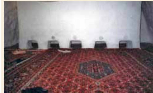
Fig. 5: Baet Al-Muna, Idlib region.

A store room, used to keep food and fruit for winter; sometimes we do not see it as a separate room but as a section called a 'Kuara' in the living room, having small holes in the lower part to place food.