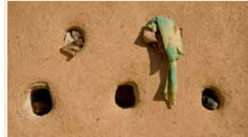
Fig. 54: Taqa, South Aleppo

Holes in earthen walls, sometimes they open onto the exterior face of the wall (used as small narrow windows in this case), in another cases not extending into the wall depth and are used for placing food or small objects.