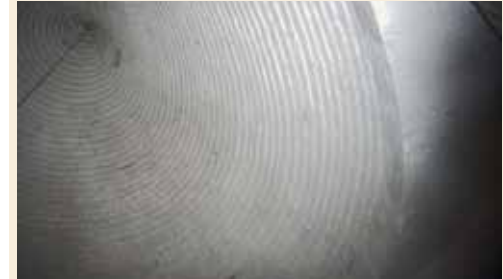
Fig. 27: Ketf, Ar-Raqqah

Constructive element or buttress integrated into earthen walls to carry earthen domes.