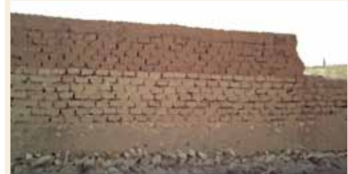
Fig. 14: Gedar, Aleppo (Habbuba).

A wall, may be constructed by several techniques of mud architecture: earthen bricks (adobe), rammed earth, mud-stone, cob, etc. It can be built with many different methods.