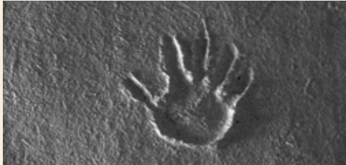
Fig. 36: Memarje, South Aleppo

A mason who builds in adobe or stone, in some regions he leaves his handprint as a signature at the end of construction.