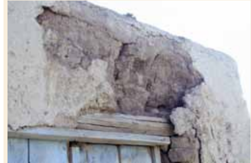
Fig. 41: Najafeh, South Aleppo

Lintel, covering doors and windows, generally made of wood.