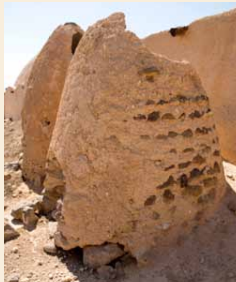
Fig. 11: Dewar, earth and stones, South Aleppo