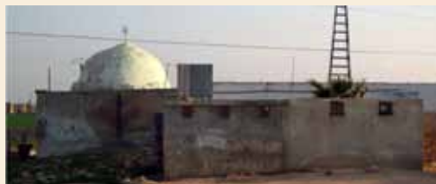
Fig. 31: Masjed, Idlib (Giobas)

Mosque built from mud or stone, without minarets in some mud villages.