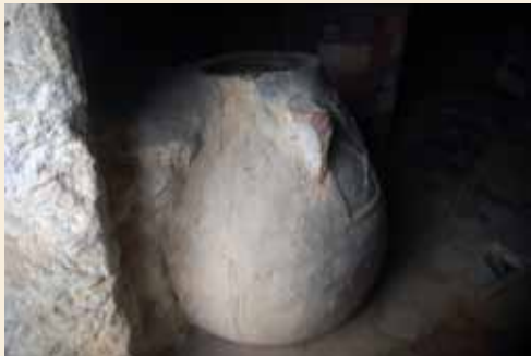
Fig. 22: Khabia, Aleppo (Saint Simon)

A water-pot, usually made of terracotta called 'Fakhar' and situated near the room door, its loam mixture (before being burnt) is composed of: three parts earth, two parts finely sieved earth and fine straw or animal hair. This mixture will be laid on a slow fire, protected from the effect of direct fire by treating its surface with animal dung called 'Fashfash'!