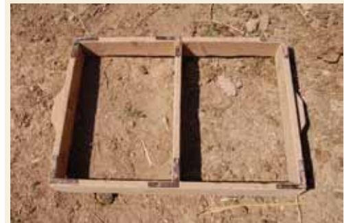
Fig. 42: Qaaleb, Al-Qameshli

Wooden module, into which loam mixture 'Teena' is poured to produce earthen bricks, with various dimensions.