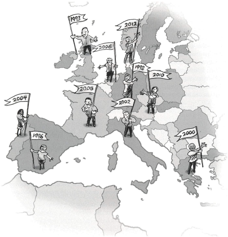
Fig. 2.2 The European IFSA Symposia have been held in various parts of Western Europe. The geographical spread shows how researchers in various countries identify with Farming Systems Research, their commitment to the European IFSA, and the value they see in meeting and discussing their latest insights