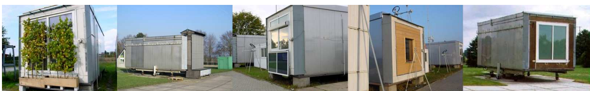
Fig. 2 Examples of test cells realized in PASSYS [10] e PASLINK (from left to right) [11]

Why the test-cell? Why it is not recommended the use of parameter defined by the use of theoretical calculations or by the use of technical labs? The thermal labs allow to carry out test in a very accurate way, and to obtain repetitive outcomes, but only in stationary condition, so without any consideration about the material response in dynamic and outdoor conditions [6]; therefore it looks that the solution can be the measurements of the new component behaviour in an existing real building [7], but this will lead in a very complex management system of the building, which need to be treated like a big laboratory [8] [9]. The studies carried out in the existing building, have demonstrated their limits, being not able to isolate in the right way the single component, and consequently to evaluate its thermo-physical characteristics. On the other hands, the use of a specific test-room in outdoor condition, with an accurate instrumentation, which is able to capture all the internal comfort parameters, appears to be the real answer to define and evaluate and characterize the new component under real user conditions.