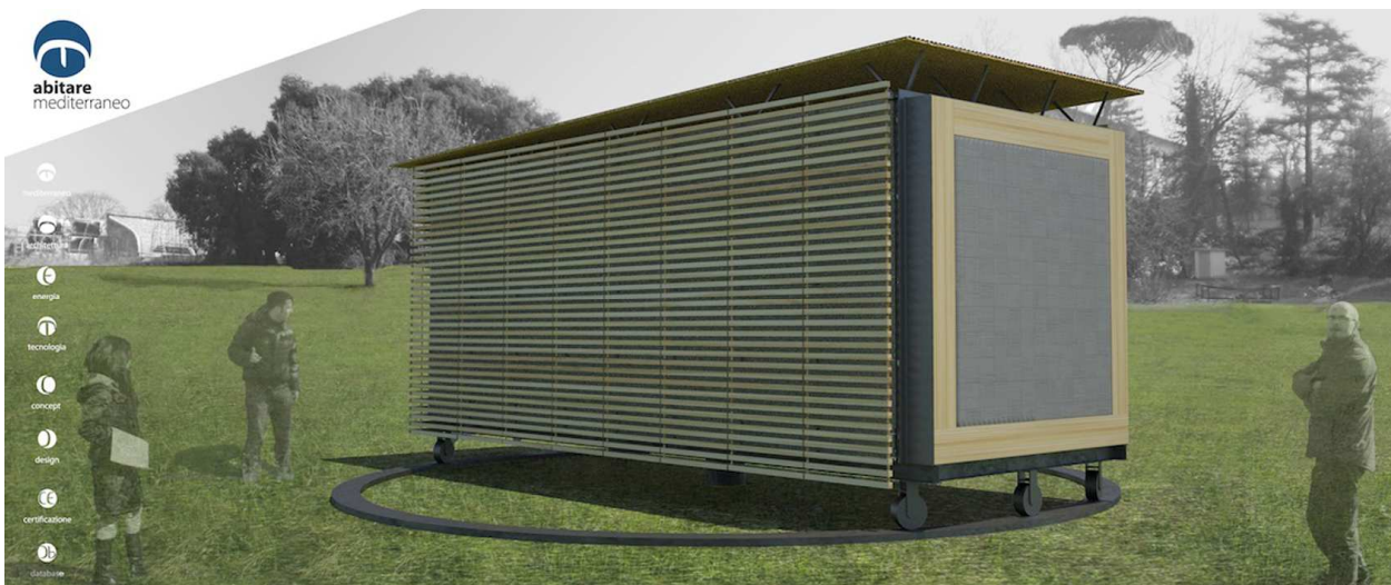
Fig. 3 The routable test cell will be able to test opaque and transparent components on different orientations

The mentioned structure, still in wooden, is designed to eliminate the thermal bridge, which would have caused the increment the vectors of thermal dispersion, causing not acceptable measurement alteration. The internal walls surface are covered by flux-tiles, plates which are able to support the sensors for the thermal flux measurement and consequently able to measure the thermal behaviour of the components to be tested.