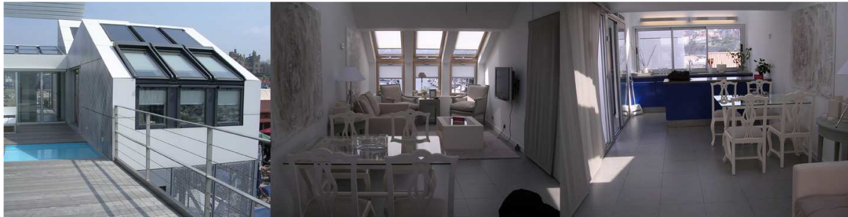
Fig. 1 ABITA, University of Florence, done a research entitled “Summer indoor comfort levels in the Mediterranean Area” and results have been used for the ATIKA building realized by VELUX.

The purpose of the research is now the evaluation of their thermal behaviour through the use of an outdoor test-cell, in order to reproduce the real and variable external climatic conditions, and consequently to define the main parameters, like the attenuation factor and thermal inertia, to characterize the component and to use results to write new algorithms for the dynamic simulation, to evaluate the complex behaviour of building in a real scale condition.