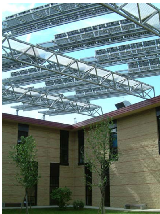
View from the court

The PV structure partially repairs from atmospheric agents. The distance between shading structures is about 1,80 m, calculated to avoid shadowing between modules.