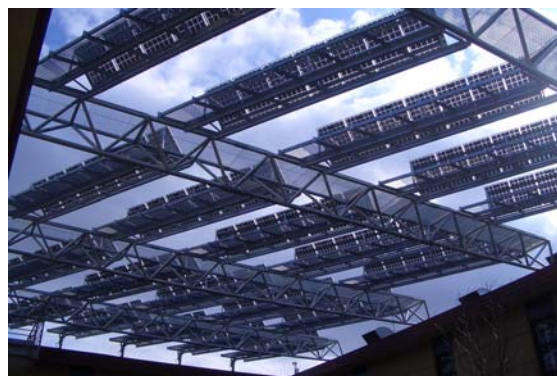
The photovoltaic system

modules, chemical erosion of the junctions and connections, losses due to diode cutting off, modules mismatching, inverter efficiency (generally 90%), eventual stops of the system. The value of these losses has been estimate around 25% of the energy produced, thus resulting in an estimated plant productivity of around 22,400 kWh/year.