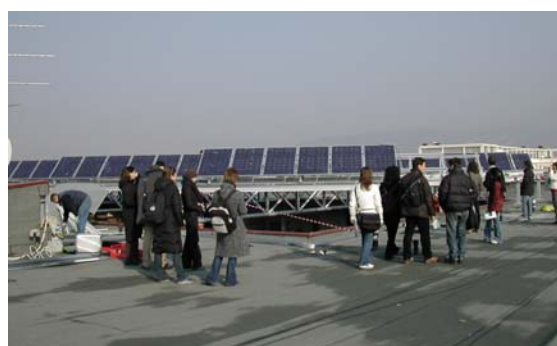
Didactic visits for Master University courses