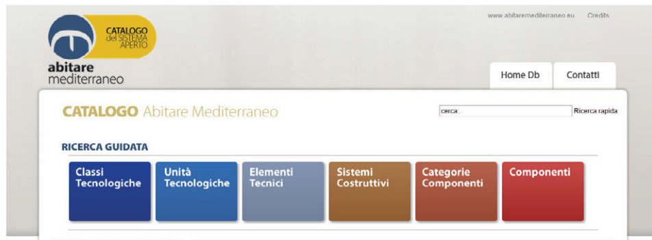
Fig. 4. Home page of products database: a section of the web site www.abitaremediterraneo.eu is dedicate to the database.

This subdivision system is thought to create a base for the software to calculate energy consumptions in the buildings. This create a relationship between the user and the software houses, in order to development future partnerships. This relationship also help an expert user that already know this type of division and languages.